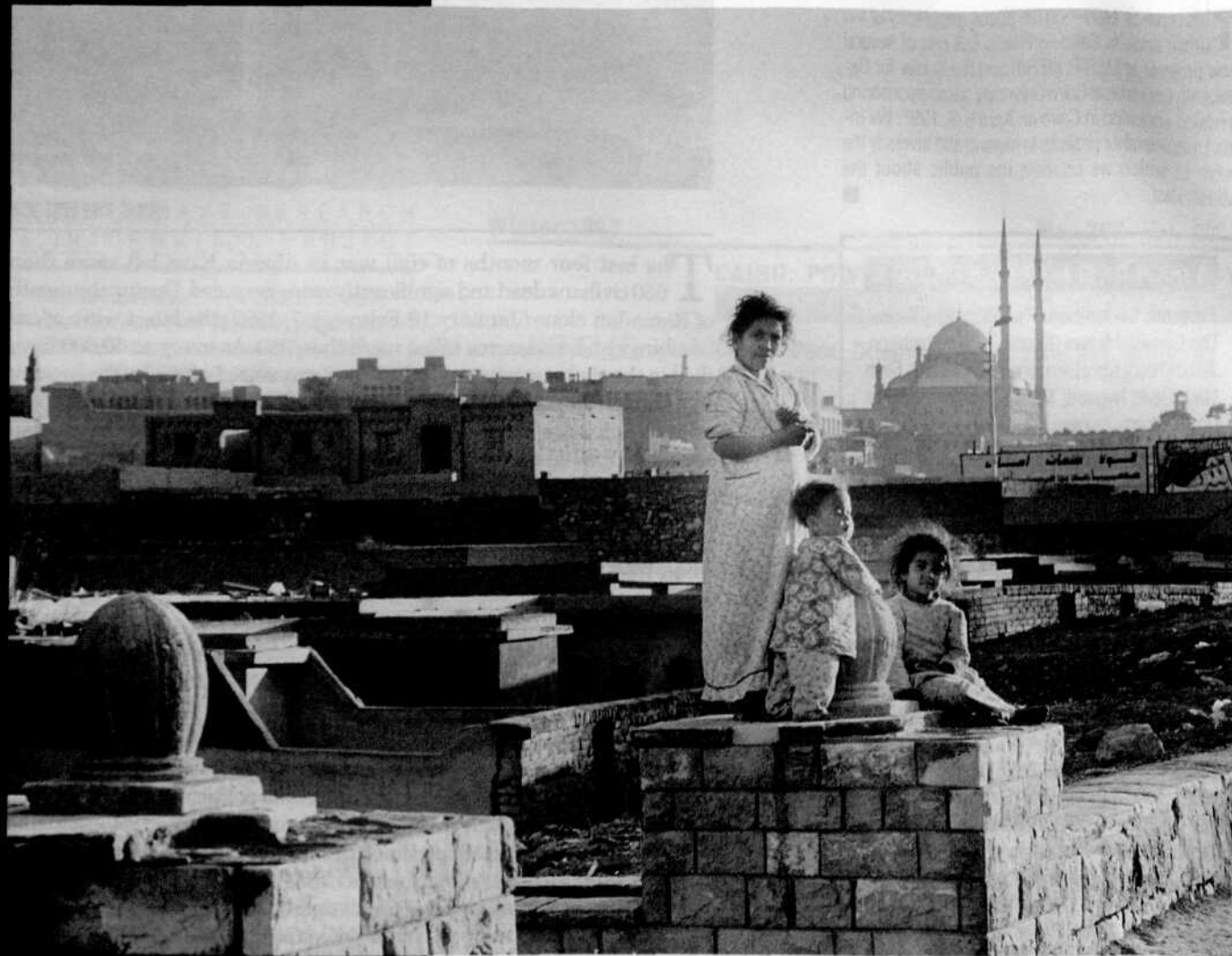
Children on the edge of the City of the Dead in Cairo.