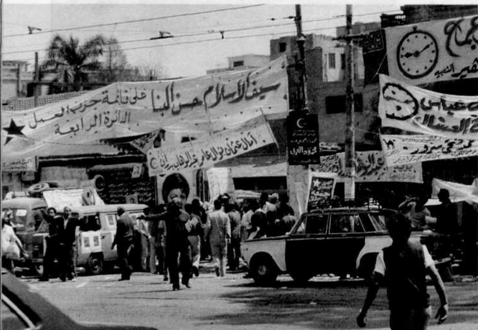
Elections in Sayyida Zeinab, Cairo.