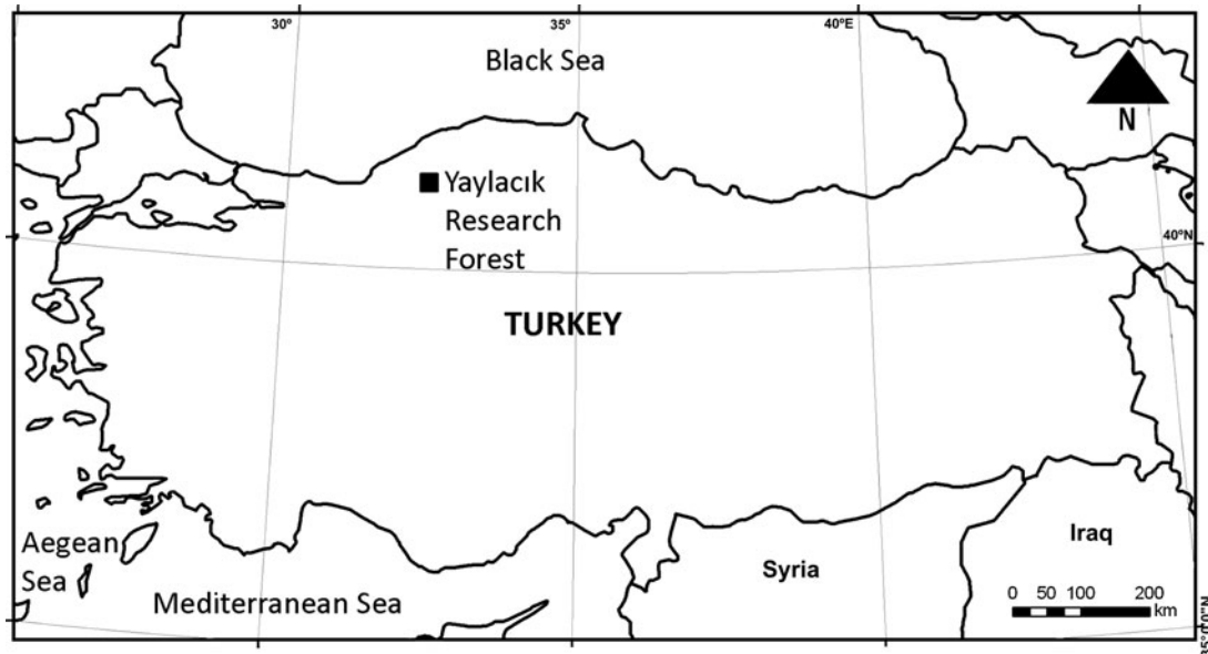
FIG. 1 Location of Yaylacık Research Forest in north-west Turkey.

comprised five consecutive phases, each with 16 camera traps for 15 days in 8 km 2 (Karanth & Nichols, 2002; Karanth et al., 2004), thus covering 80% of the study area (40 km 2 ). A total of 1,200 camera trap days of observation were made in total. The cameras were placed in each part of the study area to maximize the number of photographs taken, similar to other studies (Karanth & Nichols, 2002; Holden et al., 2003; Wallace et al., 2003; Karanth et al., 2004; Maffei et al., 2004; Silver, 2004; Wegge et al., 2004).