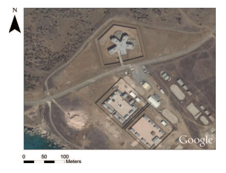
Figure 4 Satellite image of eastern edge of Camp Delta in November 2004, showing Camp Echo (two compounds of rectangular structures, bottom of image) and Camp Five (five-winged structure, top of image).