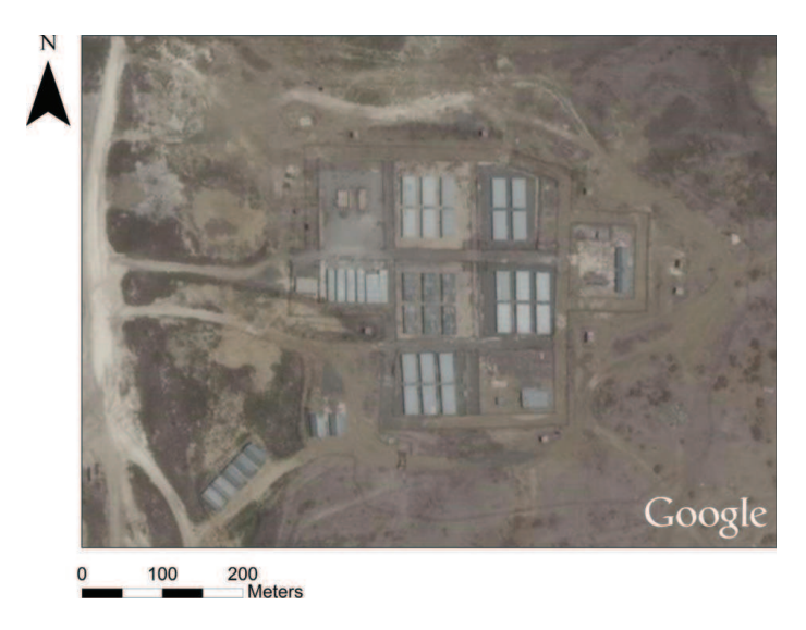
Figure 1 Satellite image of Camp X-Ray.

The data also reveal a second trend: a shift from construction of temporary barracksstyle prison structures to permanent supermax-style concrete prisons. Though the newly