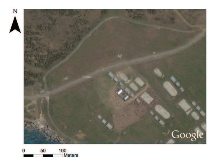
Figure 3 Satellite image of eastern edge of Camp Delta in April 2003, showing a group of small structures.