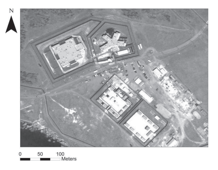
Figure 5 Satellite image of eastern edge of Camp Delta in February 2008, showing Camp Echo (two compounds of rectangular structures, bottom of image), Camp Five (five-winged structure, top right of image) and Camp Six (square structure, top left of image) (DigitalGlobe).

constructed Camp Echo was built in the barracks style, the massive multi-level prisons that followed, Camp Five and Camp Six, are both concrete supermax structures.