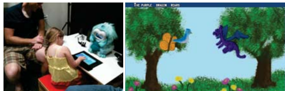
Figure 1: Experimental setup (left) and screenshot from the Story-maker app (right)

For the social robotic platform we used Dragonbot [20], a squash-and-stretch Android smartphone based robot. The facial expression, sound generation and part of the logic is generated on the smartphone, which is mounted on the face