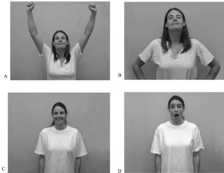
Figure 1. Examples of stimuli used in the present research. Expressions A and B represent the two versions of the pride expression, Expression C represents the happiness expression, and Expression D represents the surprise expression.

chance (i.e., 33%) according to the binomial test ( p < .05 ). Pride recognition did not vary as a function of participant gender, target gender (i.e., gender of the poser), or version of the pride expression (i.e., arms up vs. hands on hips). Nor did we find a Participant Gender \times Target Gender interaction on pride recognition. When pride was not identified correctly, it was confused with happiness 76% of the time and surprise 24% of the time. This ratio (76:24) was similar for both versions of the pride expression and for both male and female targets, and happiness was the most frequent error at every age level. 6 Pride recognition rates did not differ when the nonstandard versus standard surprise expression was included as a distractor (57% vs. 61%, respectively). However, children were