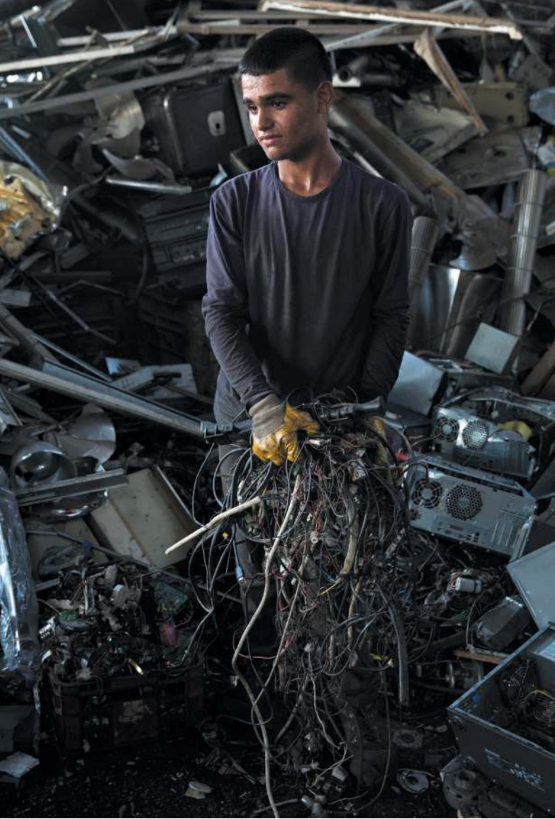
A young worker collects wiring from e-waste in Idhna.

“We suffer from many, many problems: contamination of water, agriculture, farm animals, nature.”