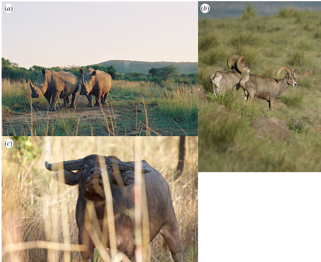
Figure 2. The potential, and complexity, of trophic rewilding for management of fire regimes as illustrated by three case studies detailed in the electronic supplementary material: (a) white rhinos and other large herbivores control fire in conservation reserves in southern Africa; (b) rewilding of communities of large herbivores may reduce the threat of wildfire in the southwestern USA; and (c) the introduced swamp buffalo may be an ecological replacement for extinct Pleistocene megafauna in northern Australia with ecological benefits that must be traded off against unwanted impacts.

approximately 500 and 800 mm, either fire or herbivory may be the dominant control on vegetation biomass [62]. Notably, it is rare to find sites with intermediate consumption by both herbivores and fire in this environmental domain, which contains many of Africa's most important conservation areas: similar ecosystems contain either many herbivores or are extensively burned [62]. In replacing fire, large herbivores like white rhinoceros ( Ceratotherium simum ) create habitat heterogeneity and facilitate many other species (see Case Study 1 in the electronic supplementary material).