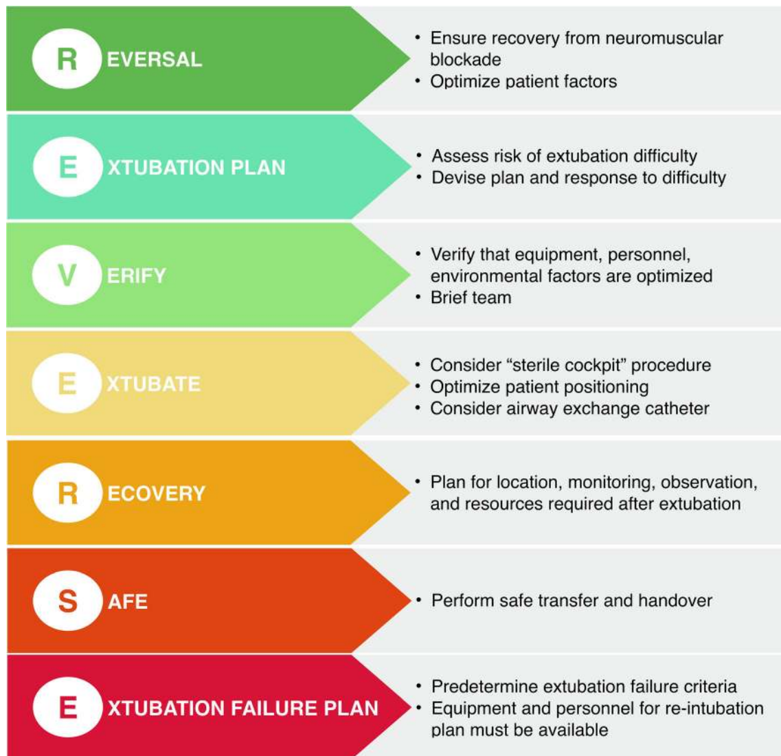
Fig. 2 Considerations for planning for safe tracheal extubation.

was originally difficult to intubate, or because of an interval event (Table 11).