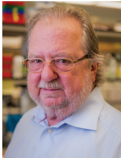
Figure 1. James P. Allison is the winner of the 2015 Lasker-DeBakey Clinical Medical Research Award for pioneering a new field of cancer immunotherapy. His achievements include elucidation of the structure of the T cell antigen receptor, elucidation of the function of CTLA-4, and the development of a CTLA-4-blocking antibody, which led to the development of therapeutic CTLA-4 antibodies (ipilimumab) that are now used to treat advanced melanoma.

T cells, except for the antigen-binding site of the TCR; thus, monoclonal antibodies specific for each clone would recognize the variable regions of the TCR. Indeed, biochemical analysis of the structures recognized by the clone-specific antibodies revealed the