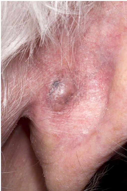
Figure 2 The patient's lesion.