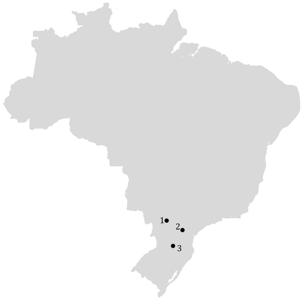
Fig. 1 Dairy farm locations (1—confined feedlot system; 2—semi-confined feedlot system; 3—pasture system)

system (MMS) as a dry lot, and the emissions of the manure management system were calculated following the IPCC (2006a).