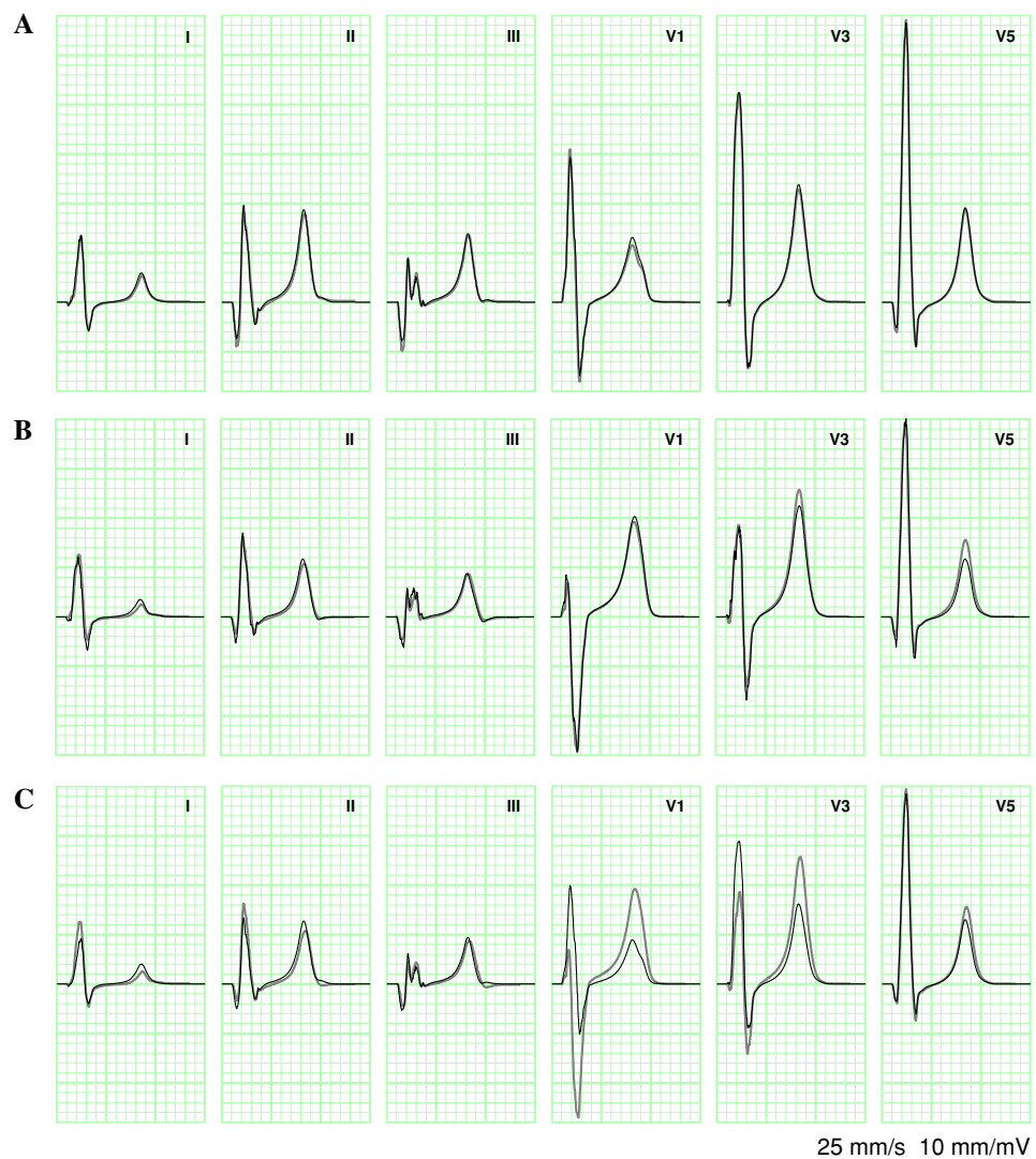
Fig. 2 Comparison of ECGs simulated with an FD model (gray) and with a BEM model (black). ECGs were obtained from a normal (sinus rhythm) activation sequence. A representative subset of the standard 12-lead ECG is shown. ECGs are displayed in the conventional way, using grid lines with 40 ms spacing horizontally and 0.1 mV spacing vertically, and no axis labels. a Both models isotropic (RD = 0.08). b Both models anisotropic (RD = 0.13, Table 3). c Fully isotropic BEM versus anisotropic FD model (RD = 0.59, Table 4)

This similarity is probably coincidental, since it only occurred for the normal set of conductivities. Moreover, the anisotropic-sphere approximation did not accurately predict f_T .