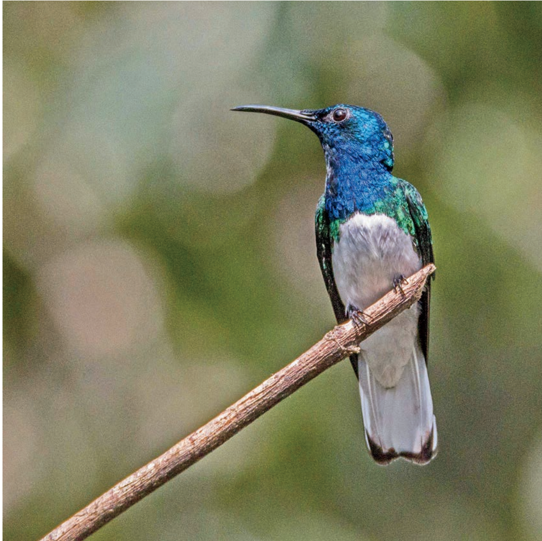
White-Necked Jacobin Hummingbird, Belize

Copyright © 2017 Massachusetts Medical Society.