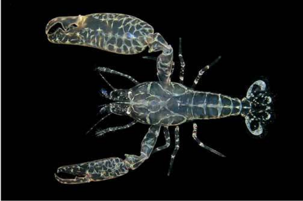
Fig. 41. Pontonia pinnae Lockington, 1878.