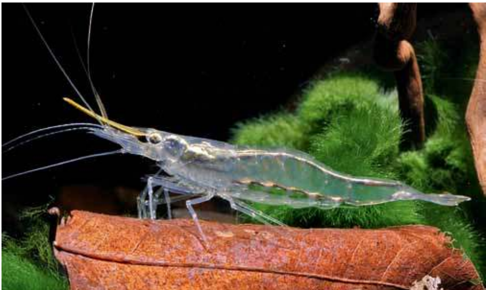
Fig. 23. Xiphocaris elongata (Guérin-Méneville, 1855).

= Xiphocaris von Martens, 1872 (type species Hippolyte elongatus Guérin-Méneville, 1855 [in Guérin-Méneville, 1855-1856], by monotypy, gender feminine); name placed on the Official List of Generic Names in Zoology in Opinion 470 in 1957)