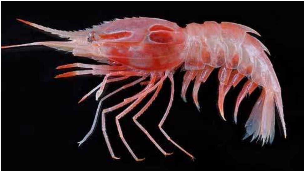
Fig. 55. Heterocarpus hayashii Crosnier, 1988.