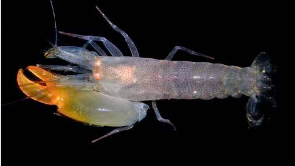
Fig. 48. Synalpheus hemphilli Coutière, 1909.