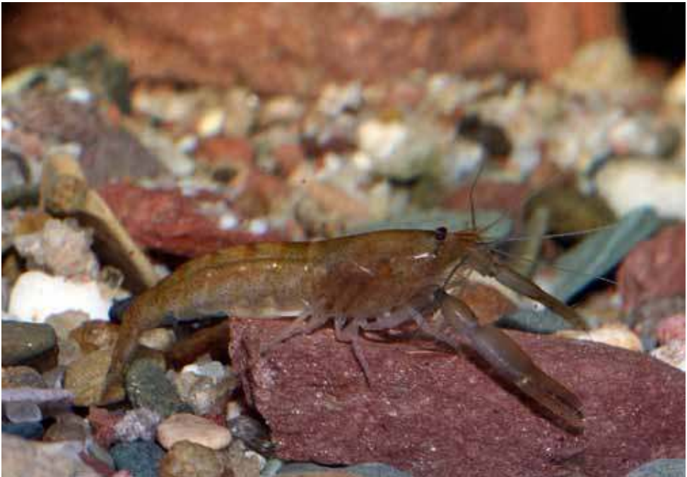
Fig. 30. Euryrhynchus tomasi De Grave, 2007.