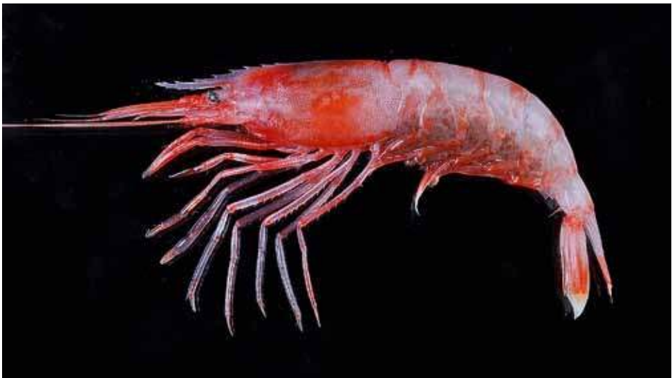
Fig. 54. Chlorotocus crassicornis (A. Costa, 1871).

? = Chlorotocus incertus Spence Bate, 1888: 674; Plate 116, Figs 1-2. [ Challenger stn 142, 35°4'S 18°37'E, Agulhas Bank, off the Cape of Good Hope, 150 fms]