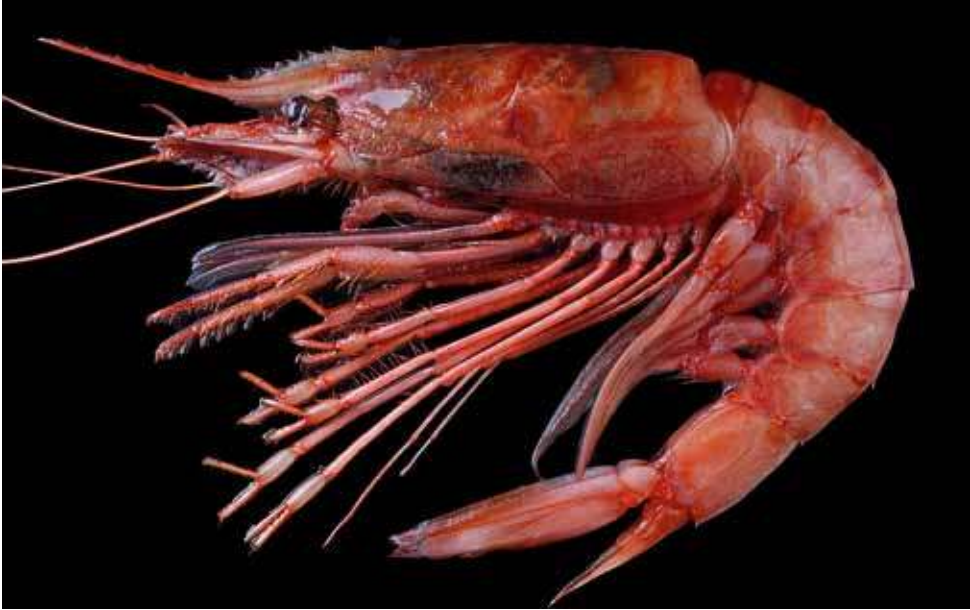
Fig. 1. Aristaemorpha foliacea (Risso, 1827).

Aristeus varidens Holthuis, 1952a: 71; Figs 17-18. [7°16'S 12°02'E, 53 M.W. Ambrizette, 440 m; 5°39'S 11°25'E, 47 M.WbyS. Cabinda, 480 m; 10°45'S 13°10'E, 35 M.W. Cap Morro, 340 m; 10°45'S 13°17'E, 40 M.W. Cap Morro, 400-500 m; 11°53'S 13°20'E, 28 M. WbyN. Egito, 500 m; 6°25'S 11°29'E, 50 M WSW. Moita Seca, ± 430 m]