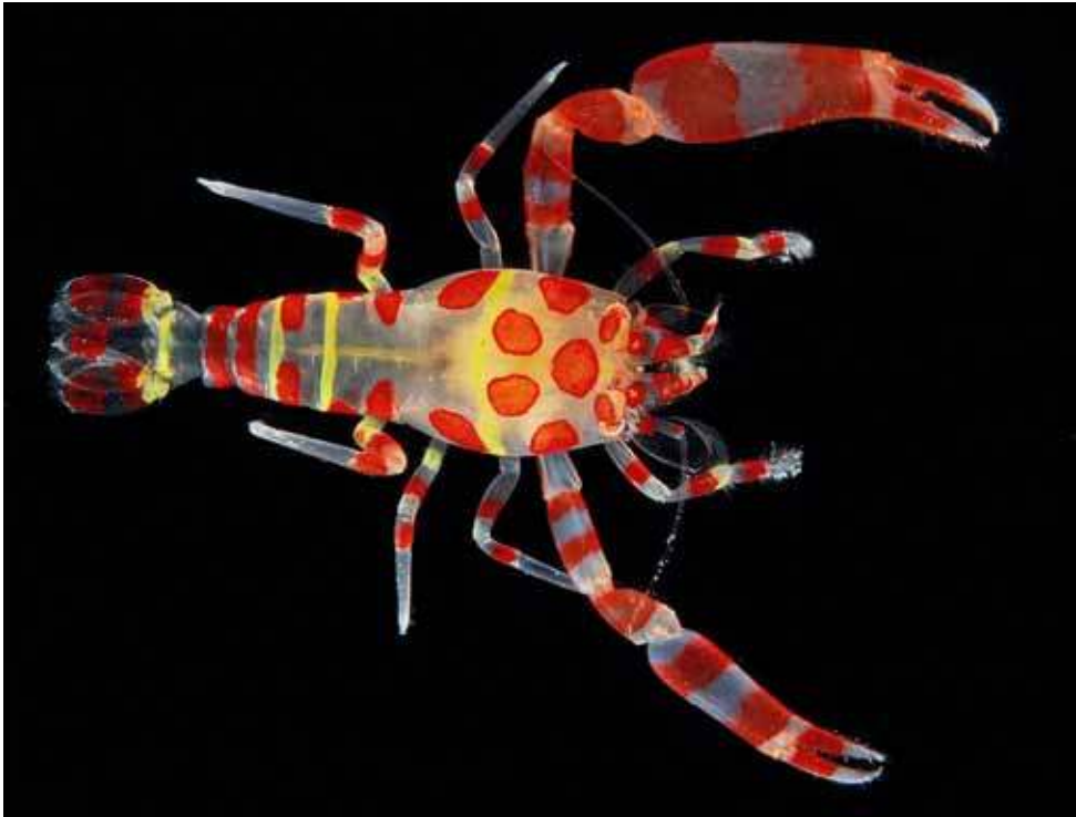
Fig. 40. Platypontonia hyotis Hipeau-Jacquotte, 1971.

Phycomenes zostericola Bruce, 2008e: 221; Figs 1-7. [Loder's Creek, Labrador, Queensland]