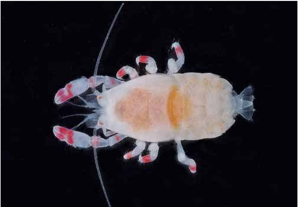
Fig. 32. Pycnocaris chagoae Bruce, 1972.