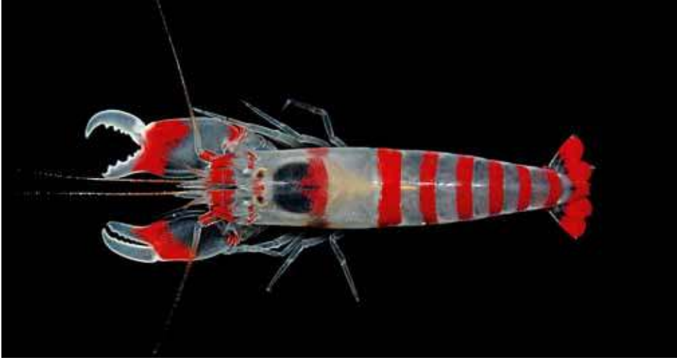
Fig. 43. Alpheopsis yaldwyni Banner & Banner, 1973.