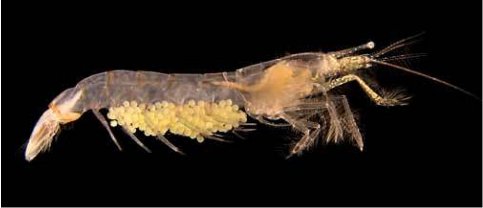
Fig. 52. Ogyrides hayi Williams, 1981.