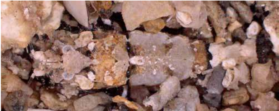
Fig. 59. Philocheiras coralliophilus Komai & Kim, 2010.