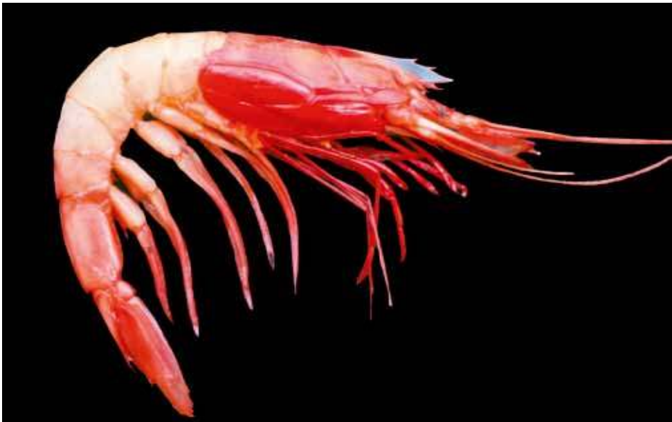
Fig. 2. Benthescycymus tanneri Faxon, 1893.