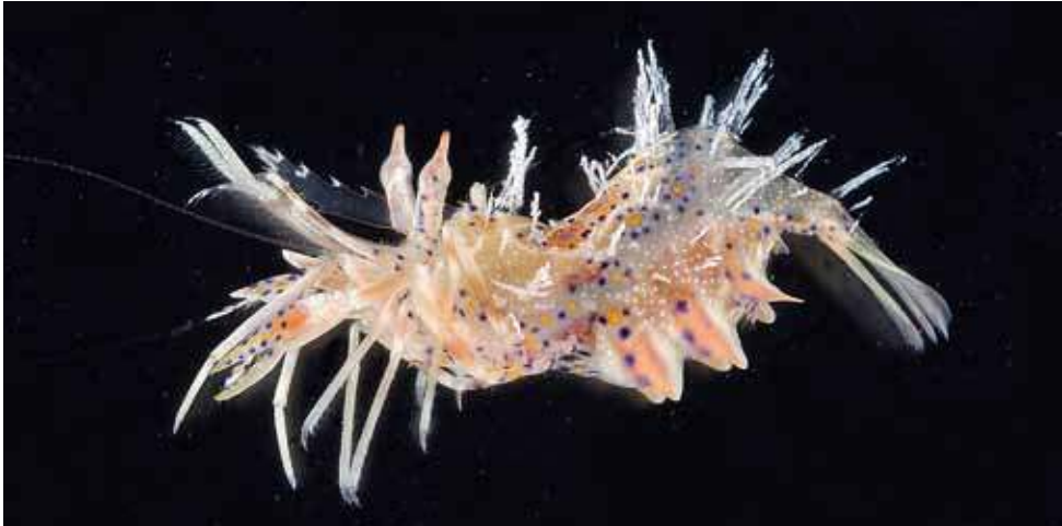
Fig. 34. Phyllognathia ceratophthalma (Balss, 1913).