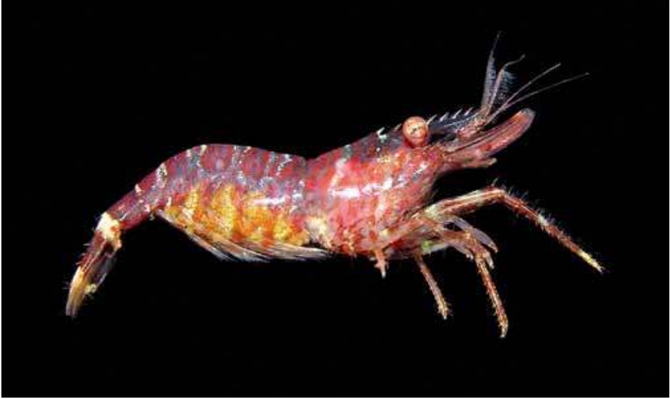
Fig. 50. Nauticaris magellanica (A. Milne-Edwards, 1891).

Calman, 1906b, gender feminine; name placed on the Official List of Generic Names in Zoology in Opinion 470 in 1957)