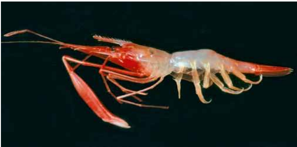
Fig. 26. Bathypalaemonella serratipalma Pequegnat, 1970. Photo Gilliss Expedition stn G-1111.