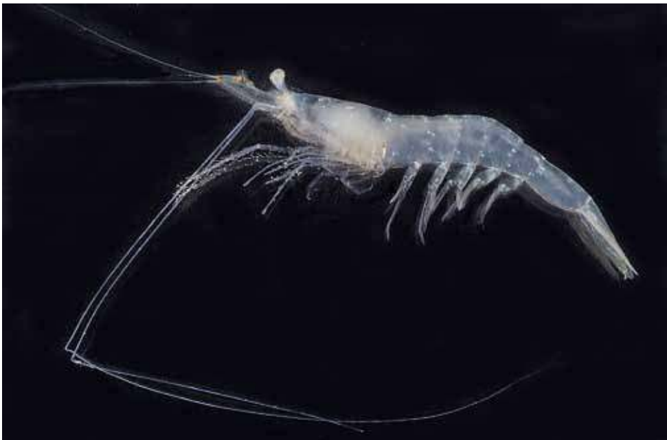
Fig. 7. Sicyonella aff. maldivensis Borradaile, 1910.

Sergia umitakae Hashizume & Omori, 1995: 72; Figs 1-4. [South of Sri Lanka]