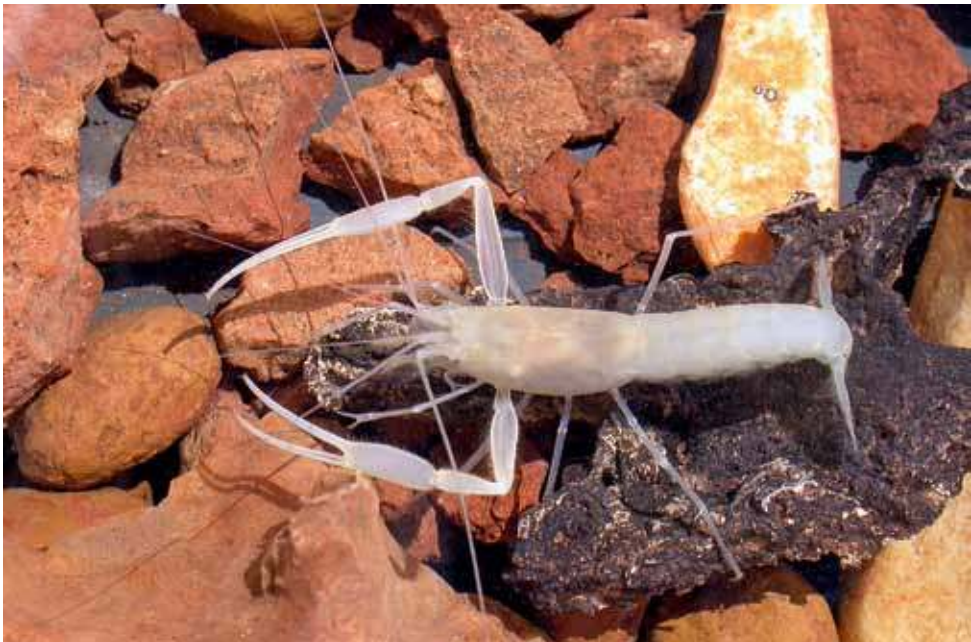
Fig. 42. Typhlocaris salentina Caroli, 1923.

Typhlocaris lethaea Parisi, 1921: 241; Figs 1-5. [Grotta del Lete (Giok-Kebir), 10 km d Est di Bengasi, Cirenaica]