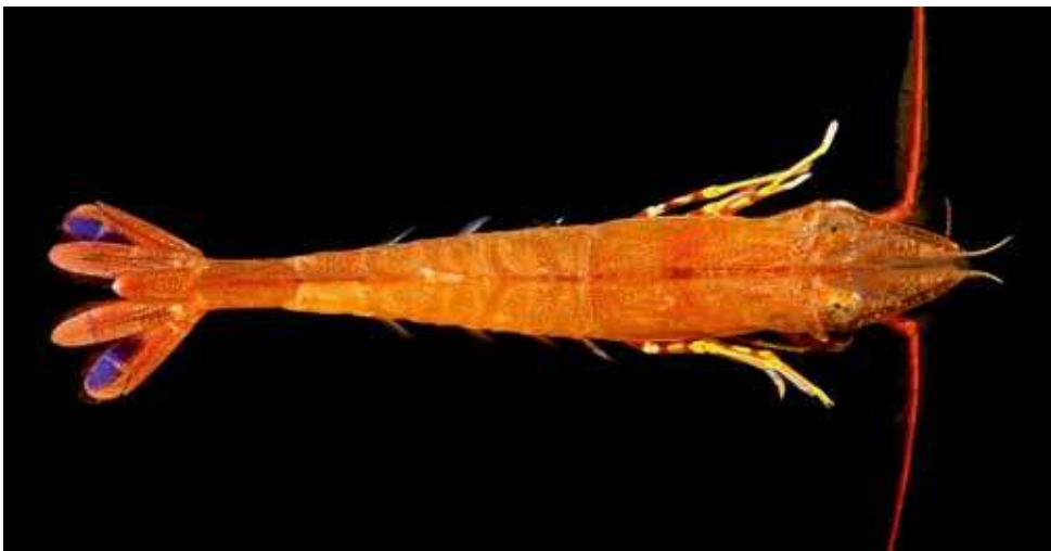
Fig. 4. Sicyonia ingentis (Burkenroad, 1938).