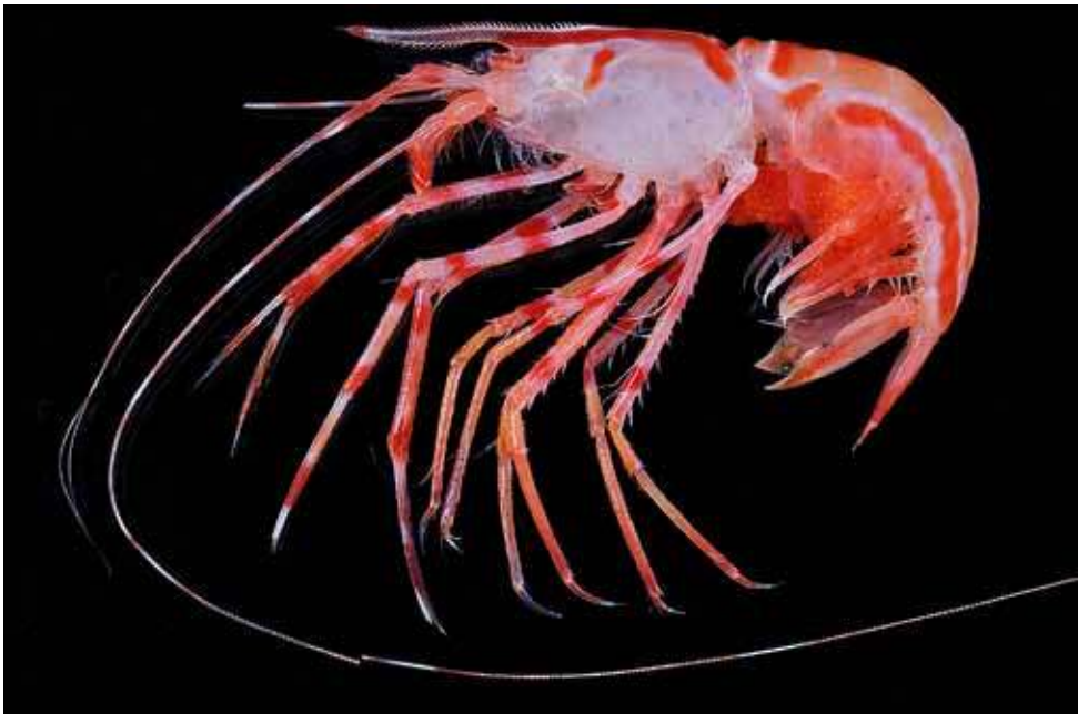
Fig. 25. Stylodactylus multidentatus multidentatus Kubo, 1942.

= Stylodactylus brevidactylus Cleva, 1990: 106; Fig. 8a-g. [Philippines, 13°40.5'N 120°53.7'E, 230-204 m]