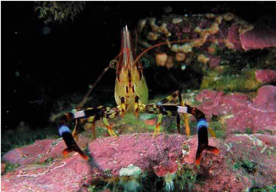
Fig. 27. Campylonotus vagans Spence Bate, 1888.

= Campylonotus rathbunae Schmitt, 1926a: 373; Plate 67, figs 1-5. [South of Eucla, Great Australian Bight, 129°28'E, 250-450 fms]