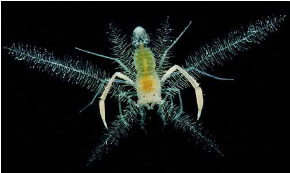
Fig. 10. Microprosthema plumicorne (Richters, 1880).

= Stenopusculus spinosus Pocock, 1890: 523. [Fernando de Noronha]