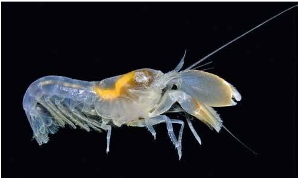
Fig. 44. Alpheus barbatus Coutière, 1897.