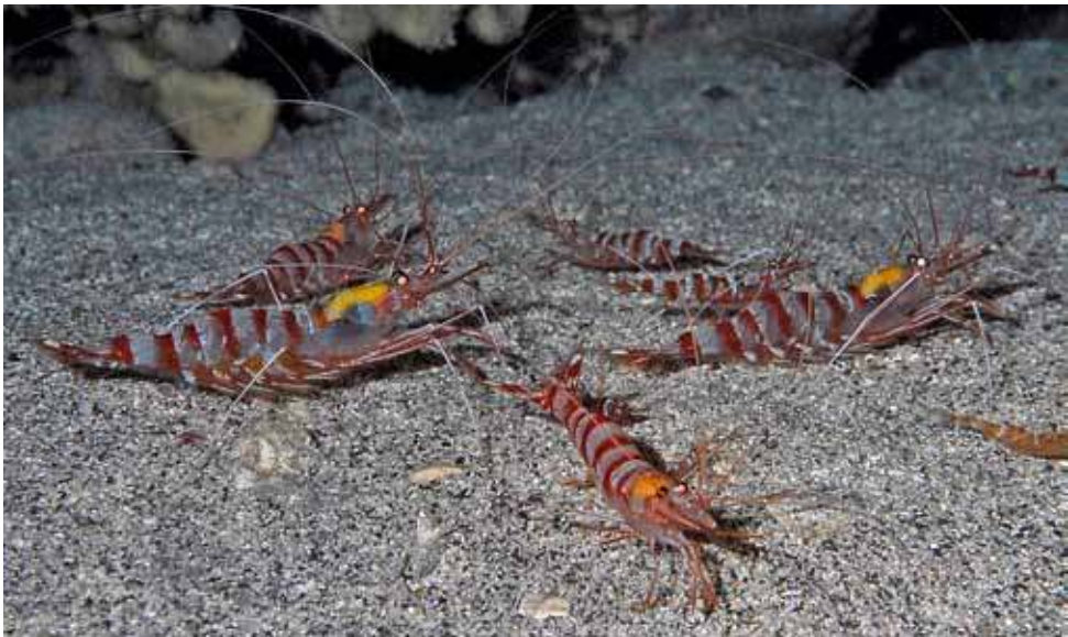
Fig. 49. Parhippolyte misticia (J. Clark, 1989).

Parhippolyte rukuensis Burukovsky, 2007c: 3; Fig. 2. [Japan, Ryukyu Islands, Ie-jima, W of Okinawa, in sea-connected cave, 30 m]