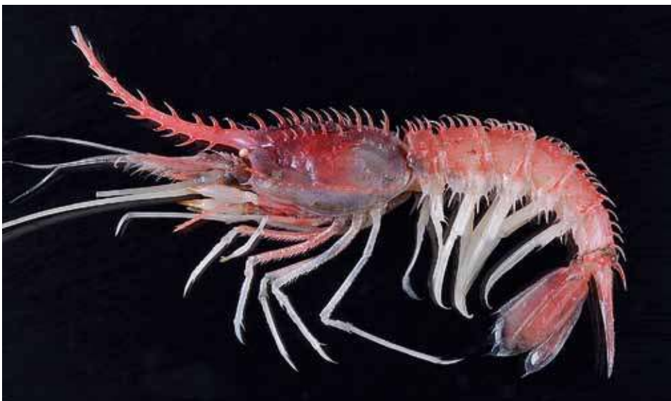
Fig. 24. Psalidopus huxleyi Wood-Mason [in Wood-Mason & Alcock, 1892].