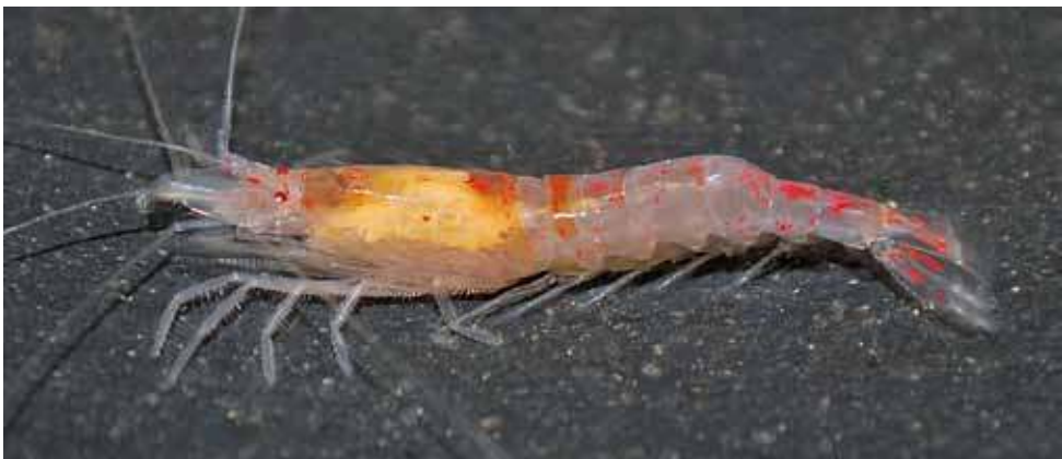
Fig. 8. Procaris hawaiana Holthuis, 1973.

Procaris noelensis Bruce & Davie, 2006: 23-33; Figs 1-3. [Runaway Cave, c. 1.5 km south from the North East Point of Christmas Island]