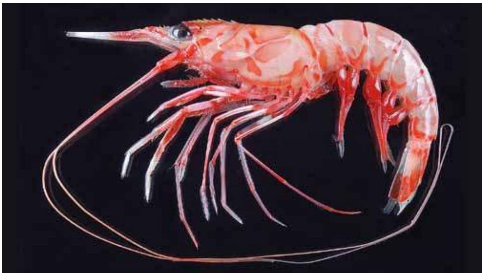
Fig. 5. Solenocera rathbuni Ramadan, 1938.

Solenocera zarenkovi Starobogatov, 1972: 367, Plate 3, fig. 14a-b. [ Orlik , stn 18, Tonkin Gulf]