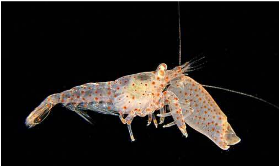
Fig. 39. Periclimenaeus schmitti Holthuis, 1951.