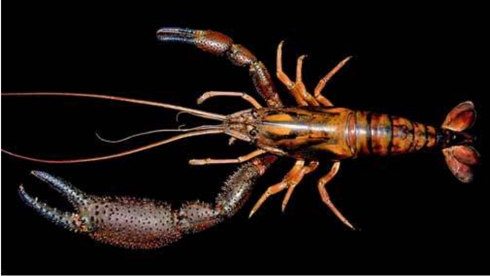
Fig. 36. Cryphiops (Cryphiops) caementarius (Molina, 1782).