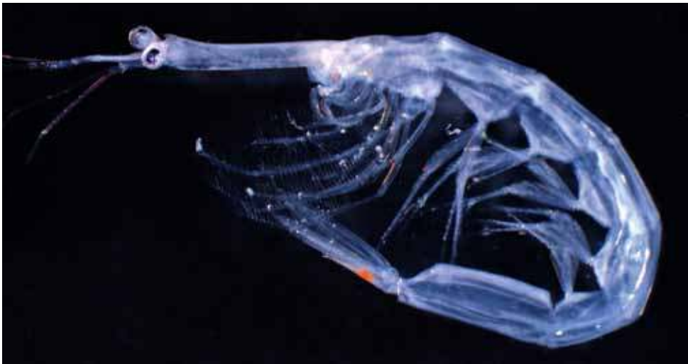
Fig. 6. Lucifer spec.

Lucifer orientalis Hansen, 1919: 55; Plate 4, figs 7a-g. [ Siboga stns 37, Sailus Ketjil, Paternoster-islands, 27 m and less; 66, bank between islands of Bahuluwang and Tambolungan, S of Saleyer, 8-10 m; 81, Pulu Sebangkatan, Borneo-bank, 34 m; 104, Sulu-harbour, Sulu-island, 14 m; 106, anchorage off