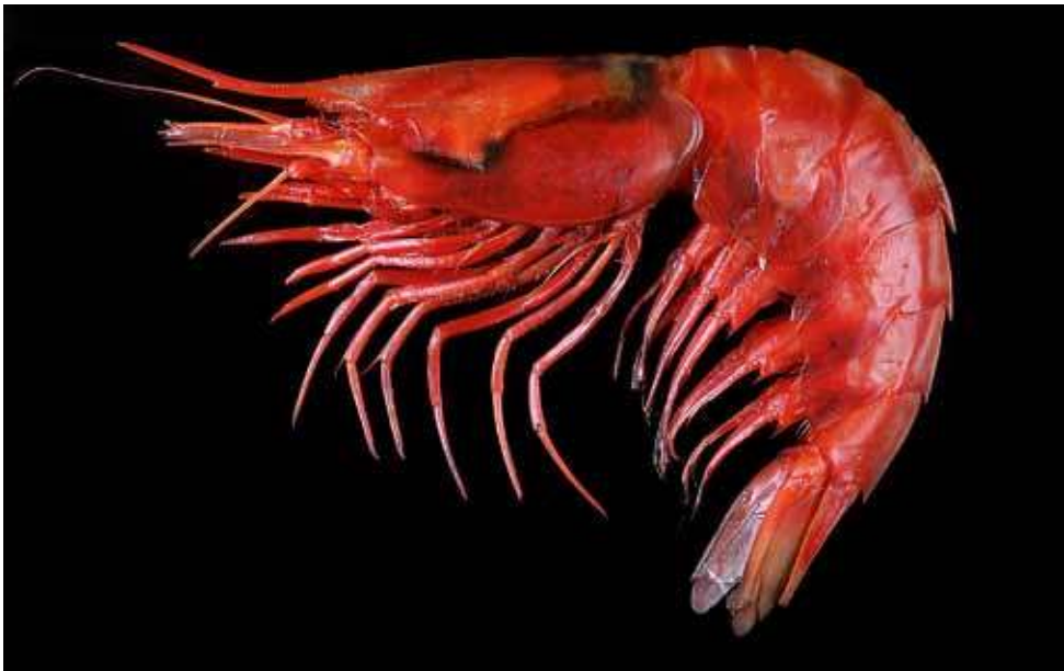
Fig. 13. Acantheephyra spec.

= Hoplocaricyphus Coutière, 1907a (type species Hoplocaricyphus similis Coutière, 1907a, probably a subjective synonym of A.[Ipheus] Pelagicus Risso, 1816, gender masculine)