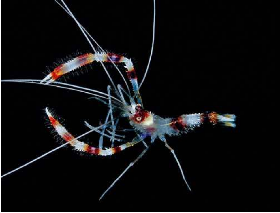
Fig. 11. Stenopus hispidus (Olivier, 1811).