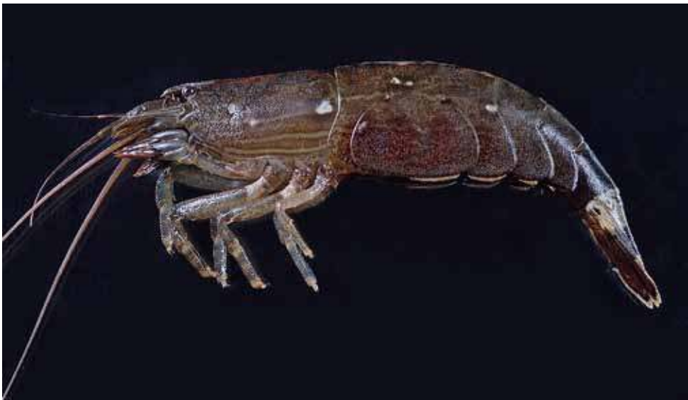
Fig. 15. Atyopsis moluccensis (De Haan, 1849).

= Vanderbiltia rosamondae Boone, 1935: 160; Plates 41-42. [Venus Point Reef, Tahiti, Society Islands, in coral]