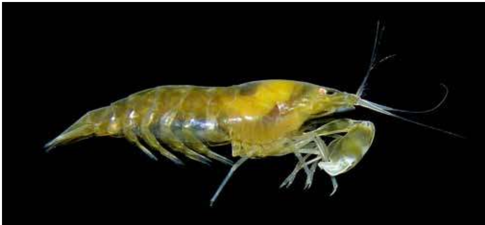
Fig. 47. Salmoneus degravei Anker, 2010.

Salmoneus pusillus Anker & Marin, 2006: 307; Figs 10-11. [South China Sea, Vietnam, Nhatrang Bay, Pyramides, 14-16 m]