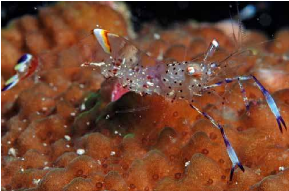
Fig. 37. Ancylomenes holthuisi (Bruce, 1969).

= Periclimenes (Ancyllocaris) lucasi Chace, 1937b: 133; Fig. 8. [San Lucas Bay, 22°53'N 109°54'W, 3-9 fms]