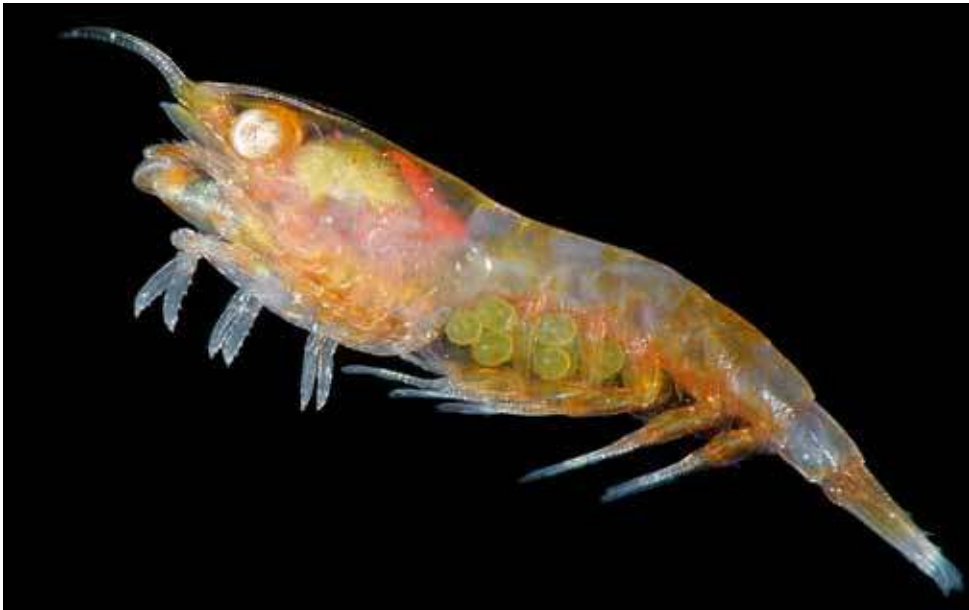
Fig. 19. Discias spec.

Discias brownae Kensley, 1983: 8; Figs 6-9. [Green Point, Port Jackson, New South Wales, 33°50'S 151°19'E, 9.8 m]