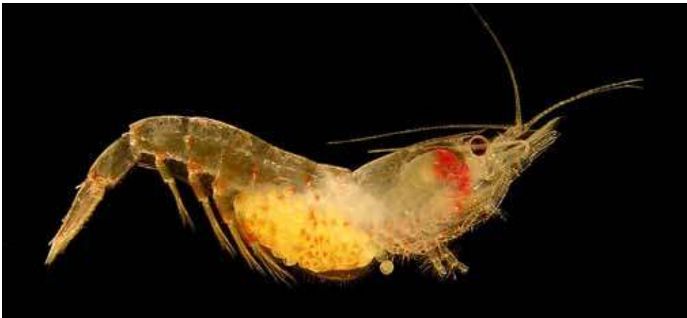
Fig. 12. Leptochela ( Leptochela ) serratorbita Spence Bate, 1888.

= Parapasiphaë compta Smith, 1884: 389. [Albatross stn 2039, 38°19'26"N 68°20'20"W, 2369 fms]