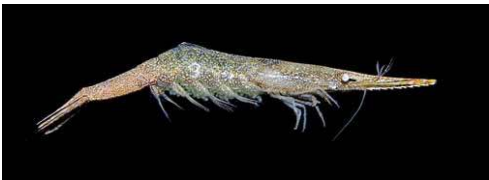
Fig. 51. Tozeuma carolinense Kingsley, 1878.

= Tozeuma carolinensis Kingsley, 1878a: 90. [Fort Macon, North Carolina]