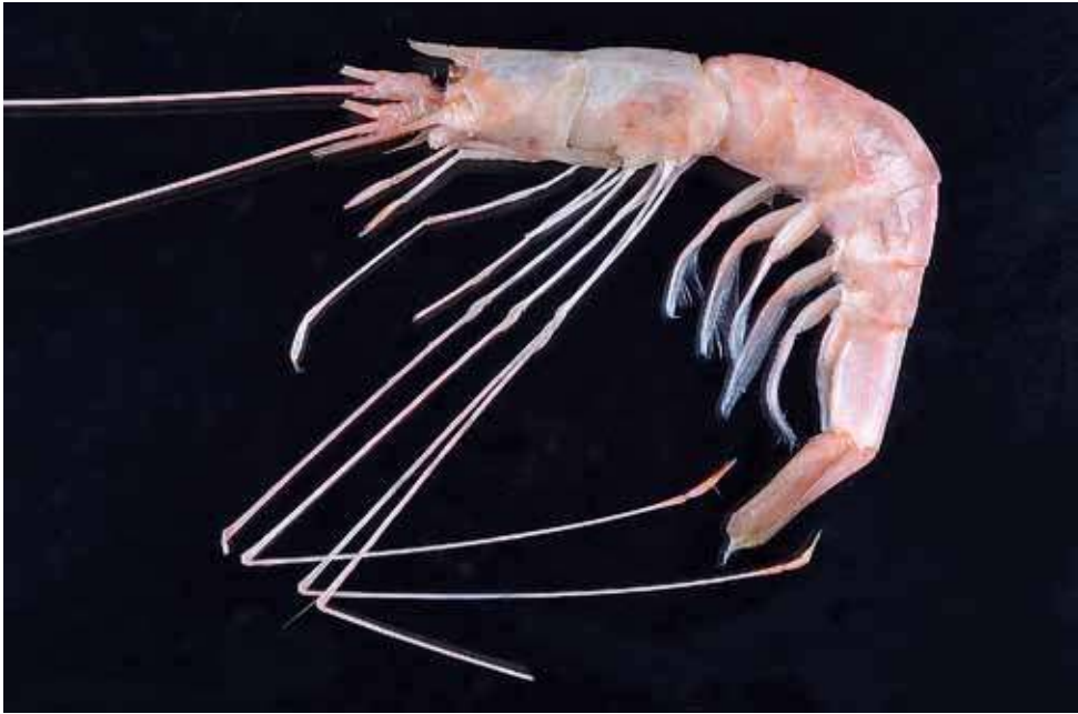
Fig. 21. Nematocarcinus spec.