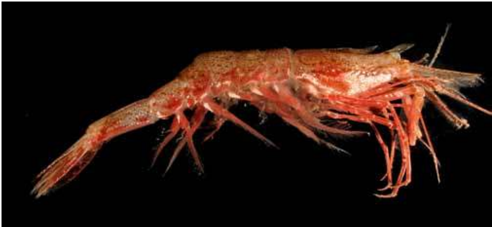
Fig. 58. Notocrangon antarcticus (Pfeffer, 1887).

= Crangon ( Notocrangon ) antarcticus var. gracilis Borradaile, 1916: 89. [Terra Nova Expedition stns 294 (74°25'S 166°47'W, 0-1750 m); 314 (5 miles N of Inaccessible Island, McMurdo Sound, 406-411 m); 316 (off Glacier Tongue, about 8 miles N of Hut Point, McMurdo Sound, 348-457 m); 338 (77°13'S 164°18'E, 379 m); 339 (77°5'S 164°17'E, 256 m); 348 (off Barne Glacier, McMurdo Sound, 366 m); 355 (77°46'S 166°8'E, 547 m)]