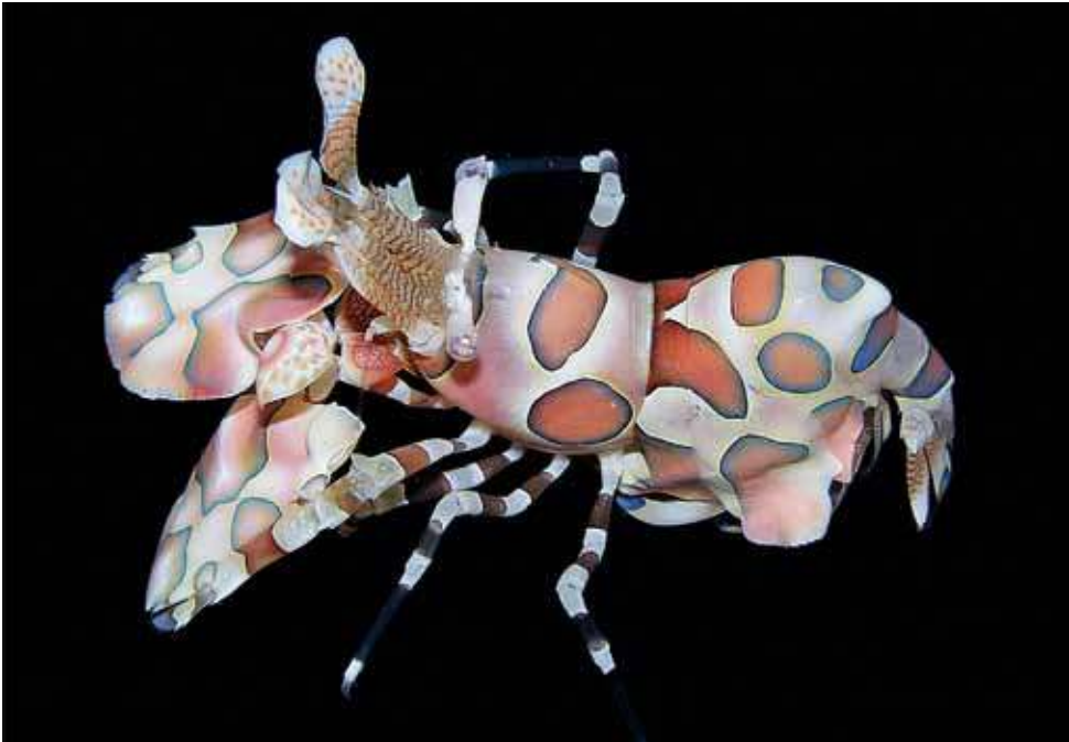
Fig. 33. Hymenocera picta Dana, 1852.

Phyllognathia simplex Fujino, 1973a: 90; Figs 1-3. [near Shuragane, Sagami Bay, central Japan, 40-50 m deep]