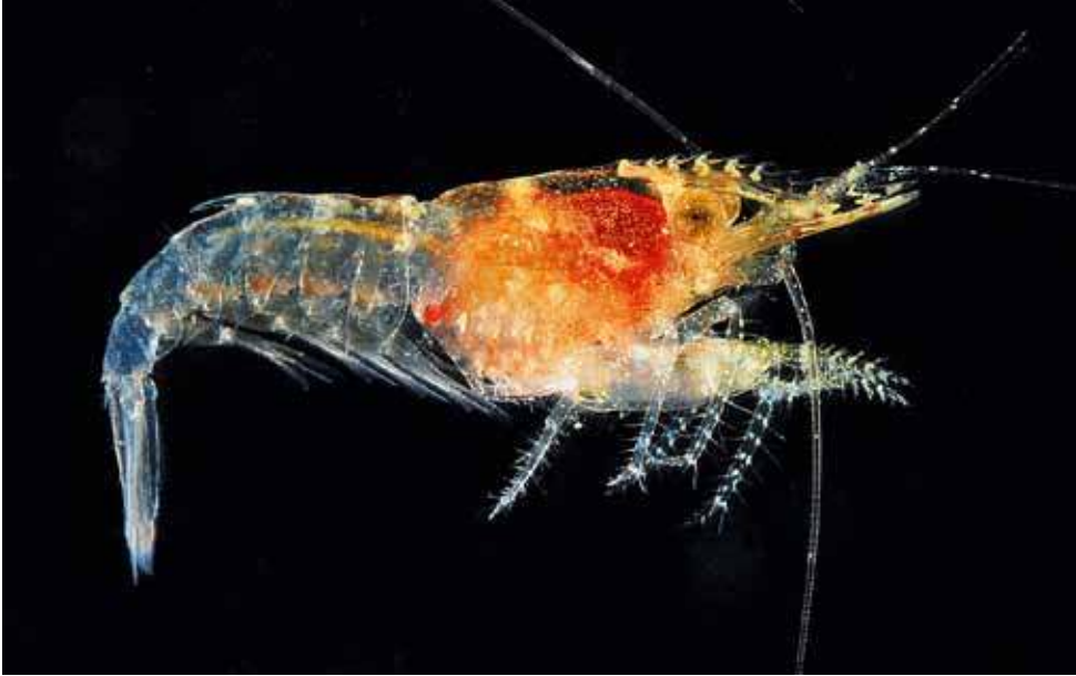
Fig. 57. Thalassocaris crinita (Dana, 1852).