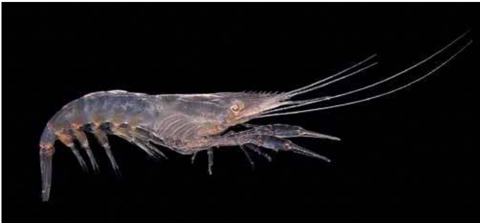
Fig. 28. Anchistioides antiguensis (Schmitt, 1924).

= Amphipalaemon Seurati Nobili, 1906b: 259. [Tearia, Tuamotu Islands according to Bruce, 1967a]