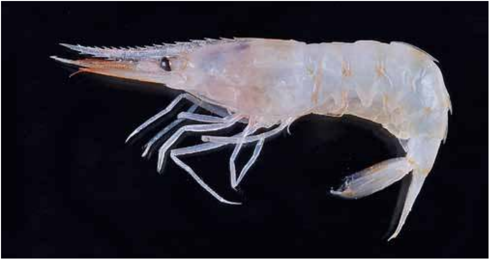
Fig. 56. Procleus levicarinus (Spence Bate, 1888).

? = Heterocarpus (Heterocapoides) [sic] glabrus Zarenkov, 1971: 193; Fig. 4(16-27). [South-China Sea, off S Vietnam, 75 m]