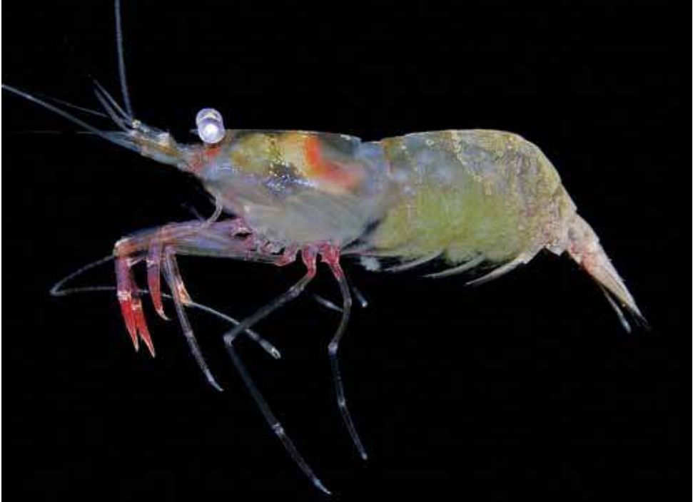
Fig. 53. Processa fimbriata Manning & Chace, 1971.