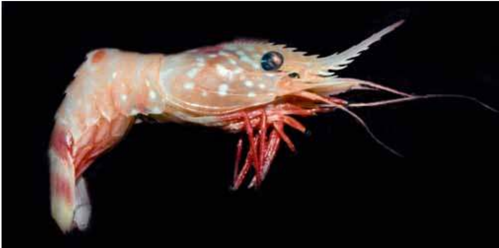
Fig. 20. Eugonatonotus crassus (A. Milne-Edwards, 1881). Photo Pillsbury Expedition sta 936b.

= Gomphonotus Chace, 1936 (nomen novum for Gonatonotus A. Milne-Edwards, 1881b, gender masculine; name placed on the Official Index of Rejected and Invalid Generic Names in Zoology in Opinion 470 in 1957)