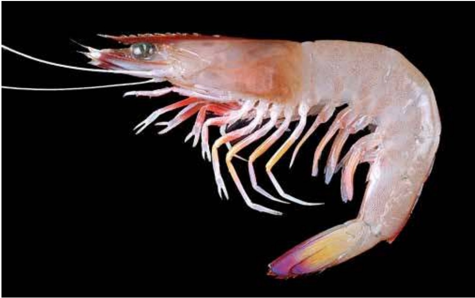
Fig. 3. Melicertus marginatus (Randall, 1840).

= Ceratopenaeus Kishinouye, 1929 (type species Parapenaeus mogiensis Rathbun, 1902b, designated by Pérez Farfante & Kensley, 1997, gender masculine)