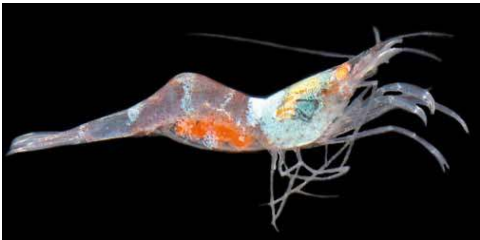
Fig. 18. Bresilia rufioculus Komai & Yamada, 2011.

Bresilia rufioculus Komai & Yamada, 2011: 72; Figs 1-6. [Ohoba Cave, Ie Island, Okinawa Islands] (Fig. 18)