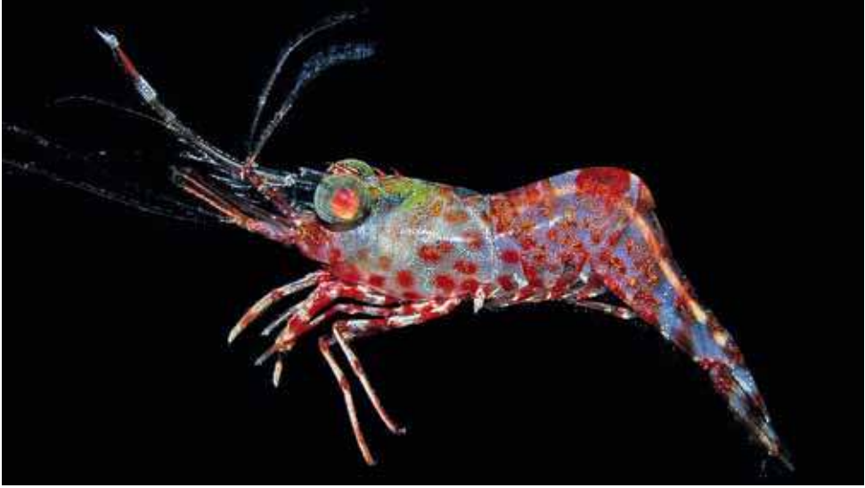
Fig. 22. Cinetorhynchus manningi Okuno, 1996.