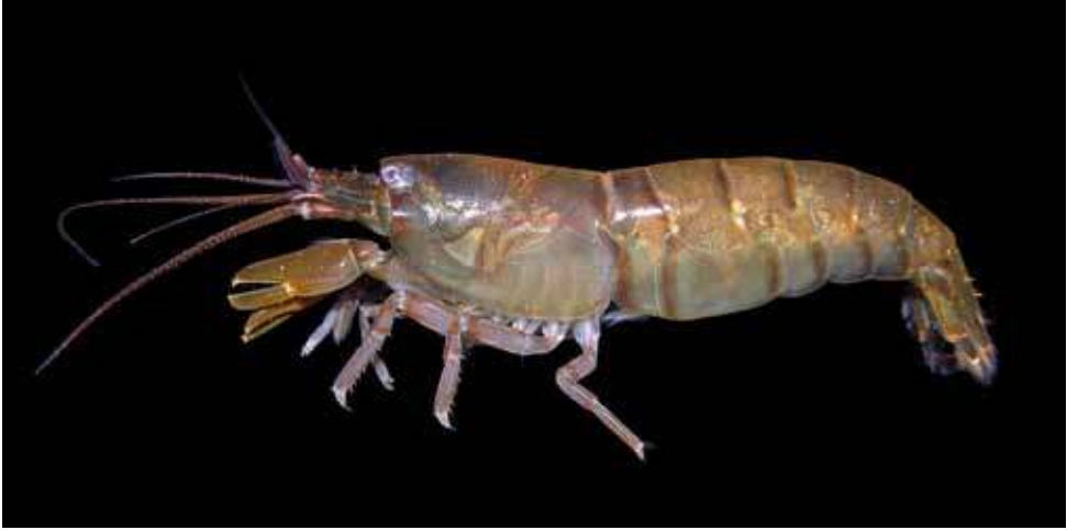
Fig. 45. Betaeus emarginatus (H. Milne Edwards, 1837).

Bruceopsis guamensis Anker, 2010b: 399; Figs 1C, 6-8. [Marian Islands, Guam, Agat Bay north of Alutom Islet, under rocks, 3-7 m]