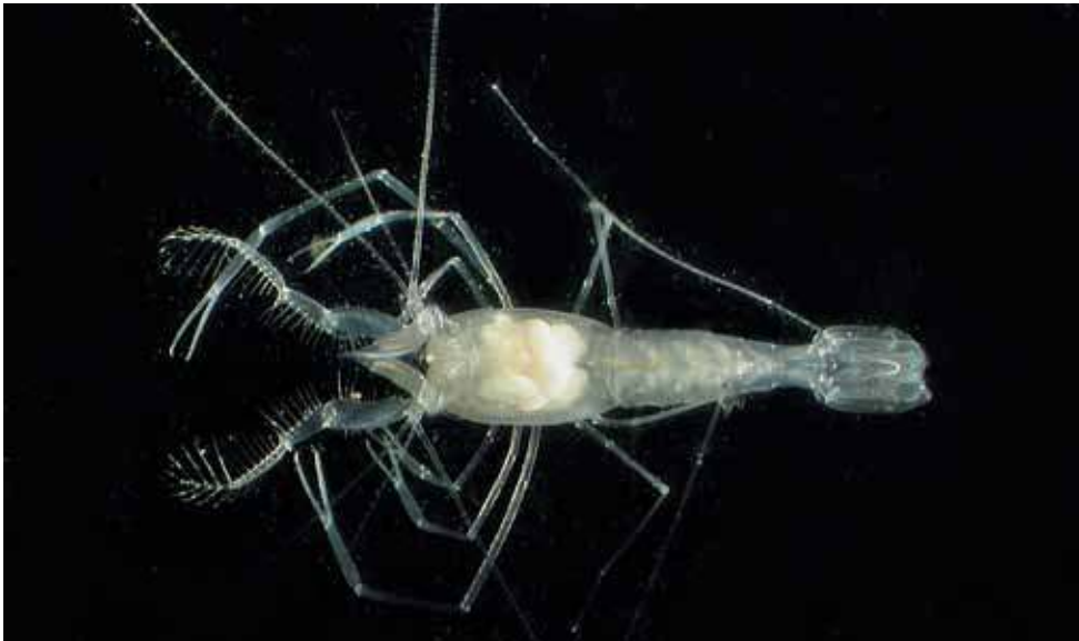
Fig. 9. Macromaxillocaris bahamaensis Alvarez, Iliffe & Villalobos, 2006.

Macromaxillocaris bahamaensis Alvarez, Iliffe & Villalobos, 2006: 370; Figs 2-7. [Oven Rock Cave, Great Guana Cay, Exuma Cays, Bahamas] (Fig. 9)