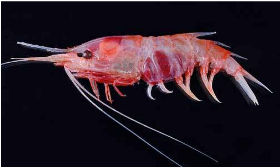
Fig. 14. Oplophorus gracilirostris A. Milne-Edwards, 1881.

= Oplophorus longirostris Spence Bate, 1888: 765; Plate 127, fig. 2. [ Challenger stn 174c, 19°07'50"S 178°19'35"E, off Kandavu, Fiji Islands, 610 fms]