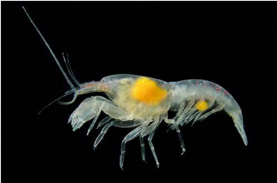
Fig. 46. Leslibetaeus coibita Anker, Poddoubtchenko & Wehrtmann, 2006.

Leptalpheus pierrenoeli Anker, 2008: 783; Figs 1-2, 3A-B. [Panama, Caribbean coast, Isla Grande, southern shore, village, near Cabañas Super Jackson, from burrow, 0.5-1.0 m]