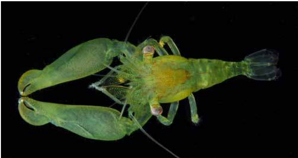
Fig. 38. Coralliocaris viridis Bruce, 1974.

Coralliocaris sandyi Mitsuhashi & Takeda, 2008: 11; Figs 1C-D, 6C-D, 8-10. [off Kuro-shima Island, Rykyu Islands, 8 m, from Acropora sp.]