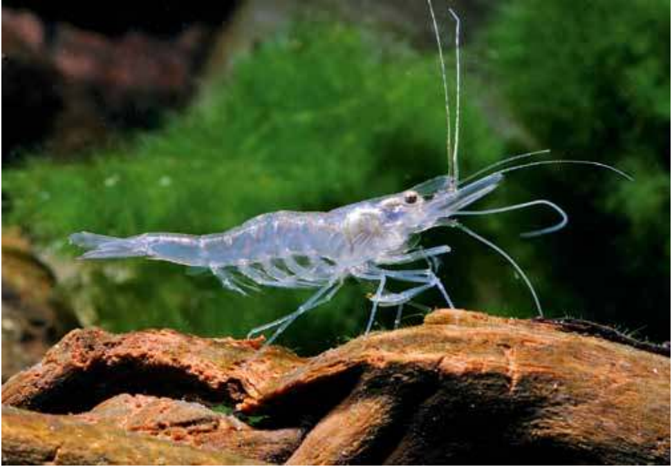
Fig. 29. Desmocaris trispinosa (Aurivillius, 1898).