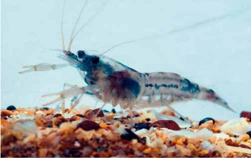
Fig. 35. Kakaducaris glabra Bruce, 1993.