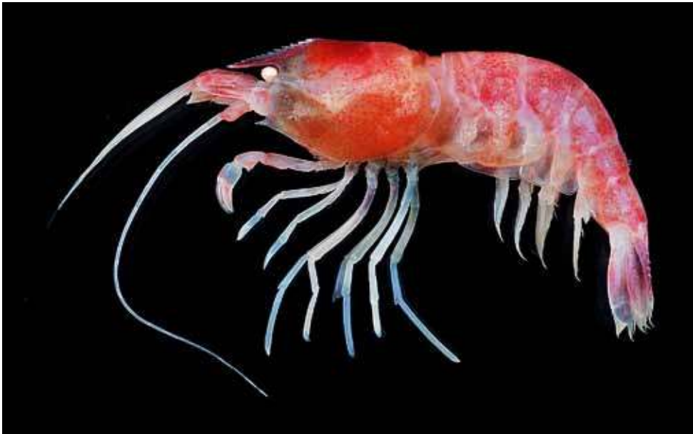
Fig. 17. Alvinocaris chelys Komai & Chan, 2010.

Alvinocaris markensis Williams, 1988: 264; Figs 1-2, 71. [Mid-Atlantic Rift Valley about 70 km south of Kane Fracture Zone, 23°22.09'N 44°57.12'W, 3437 m]