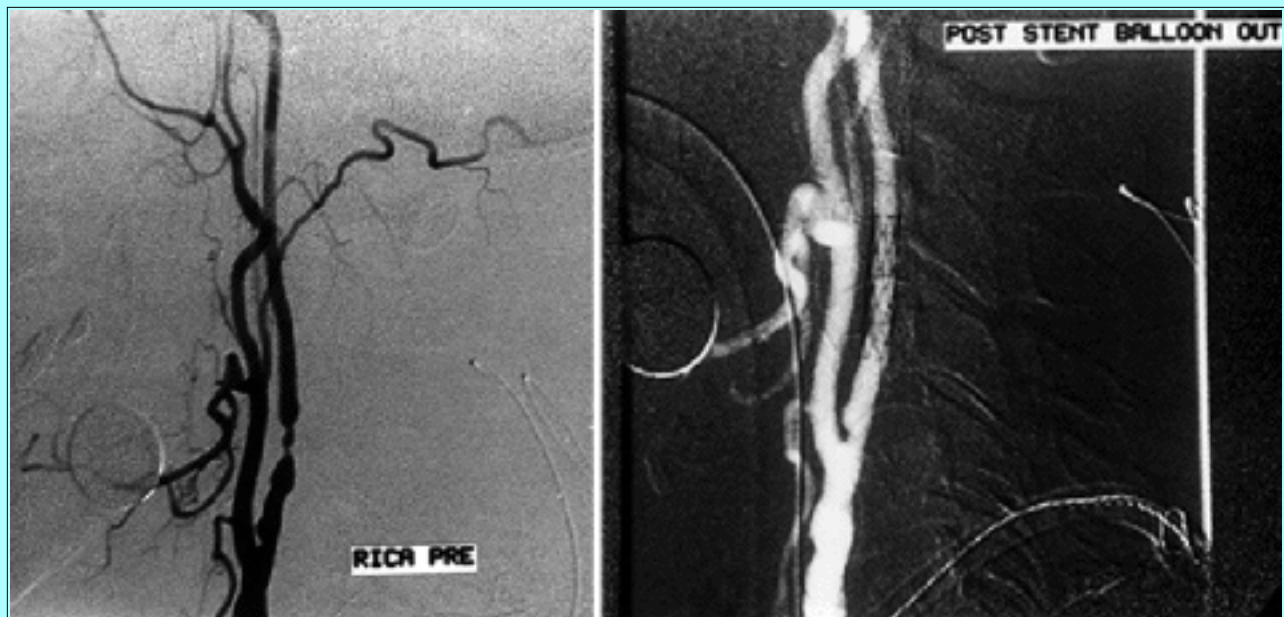
Fig. 1. Angiograms obtained in a 70-year-old-patient with recurrent stenosis. Left: Preprocedure angiogram demonstrating 80% stenosis. Right: Postangioplasty and stent placement angiogram demonstrating stent in place.

Figure 2 provides an interesting example of how angioplasty and stent placement can be useful in situations in which it might not be initially considered. This patient (Case 7; Table 1) underwent carotid endarterectomy and developed new right-sided hemiparesis and aphasia in the postanesthesia care unit. On emergency reexploration of the wound and investigation using Doppler ultrasound of the endarterectomy site, no clot was noted at the operative site. An intraoperative angiogram was obtained, which showed stenosis high in the internal carotid artery to the skull base. At this time, the neurosurgery department was consulted for emergency stent placement. The procedure was performed in the operating room with an intraoperative digital subtraction angiography unit. With stent placement, there was restoration of normal flow in the carotid artery, with a residual 30% stenosis in the distal internal carotid artery. The patient's neurological deficit resolved completely over the ensuing 24 hours. There was initial concern about placement of this stent; however, the stenosis was distal to the endarterectomy and the stent was not placed over the fresh arteriotomy.