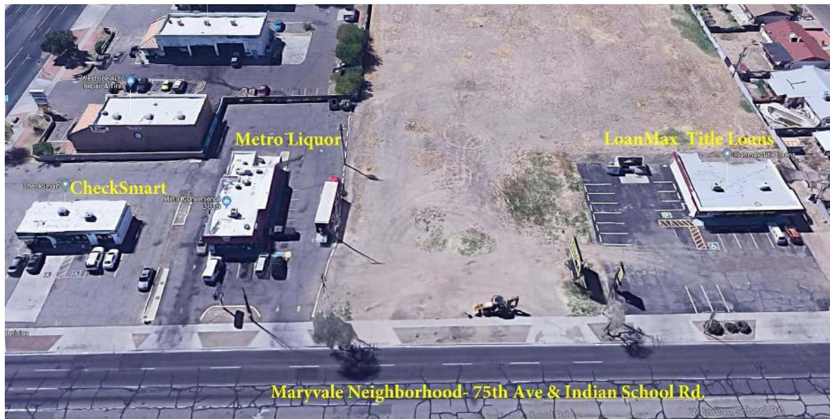
Figure 4.

or otherwise, steadily increased throughout the 1980s and accelerated after the passing of the North American Free Trade Agreement (NAFTA) in 1994 (Gibson and Lennon 1999; Laubey 2008; Sears 2014). As corporate and investment capital pushed south, the bodies pushed north. The fluctuating demand for cheap labor intermixed with the anti-immigrant fervor that has marked post 9/11 society has led to a particularly complicated scenario for the intergenerational families that have anchored themselves in areas such as Maryvale. These histories are embedded in, and retold through a landscape that is so clearly demarcated along difference.