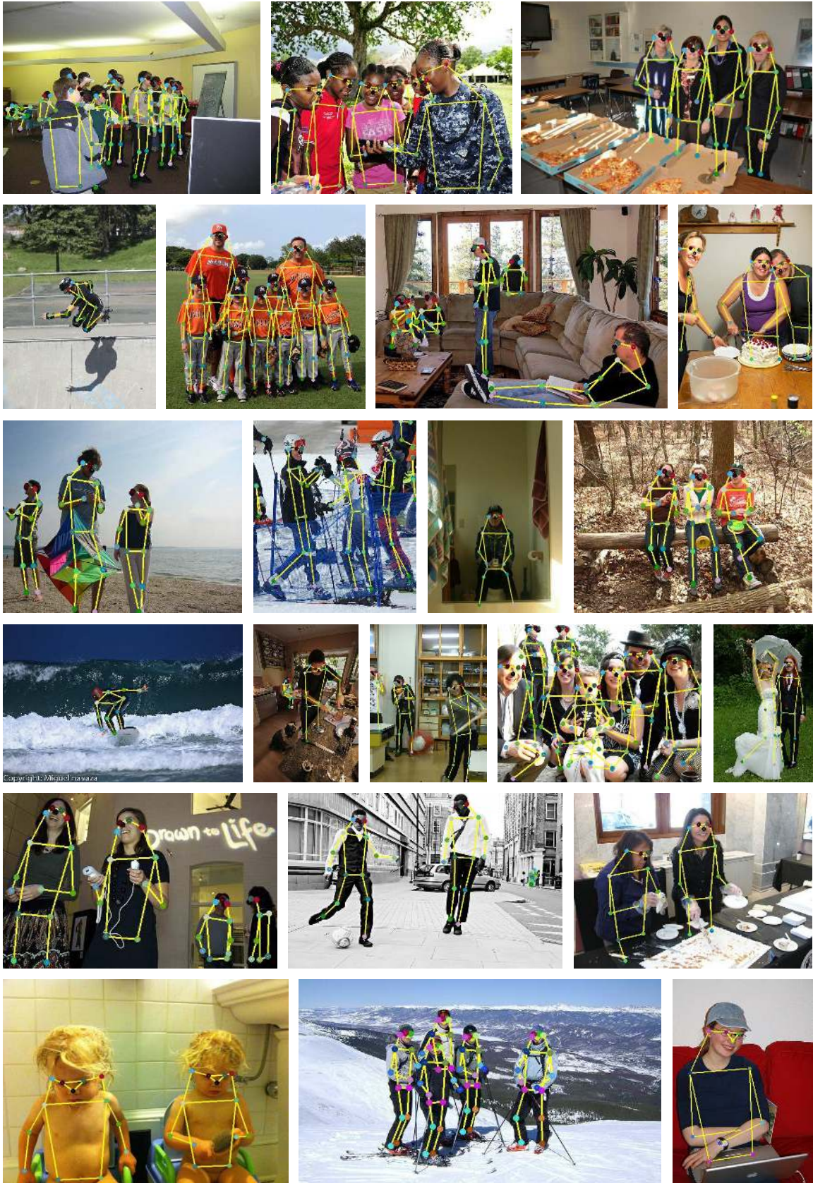
Figure 3. Some results of our method.