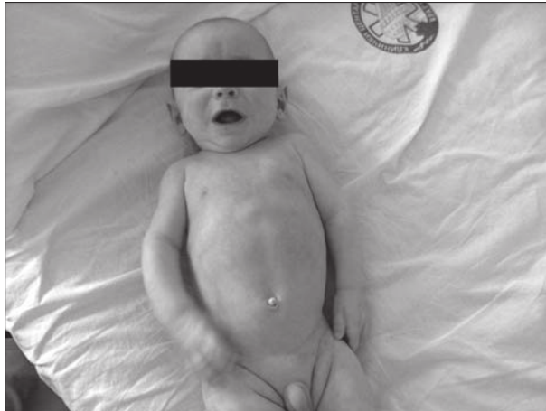
Figure 1. Picture of our patient showing characteristic rachitic signs: chicken breast, Harrison's groove, rachitic rosary, thickening of the distal segments of the wrist, and large abdomen

The child's parents were healthy and young, with lower levels of educational attainment and of modest means.