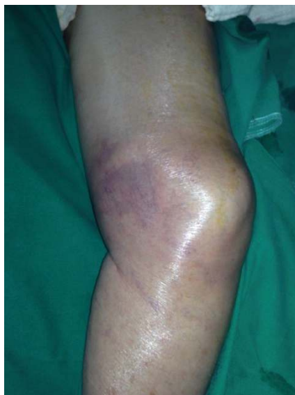
Figure 1. Preoperative presentation. Image of medial surface of the thigh, showing voluminous hematoma and ecchymosis of subcutaneous tissues.