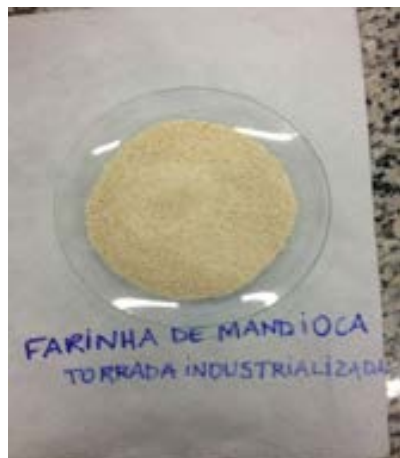
Figure 3. Industrialized, toasted cassava flour.