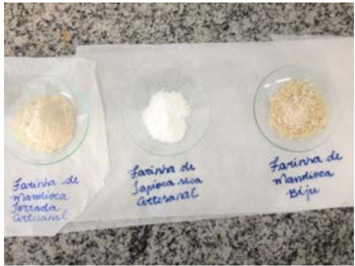
Figure 1. (from left to right) Artisan toasted cassava flour, artisanal dried cassava flour and “bi-juzada” cassava flour.