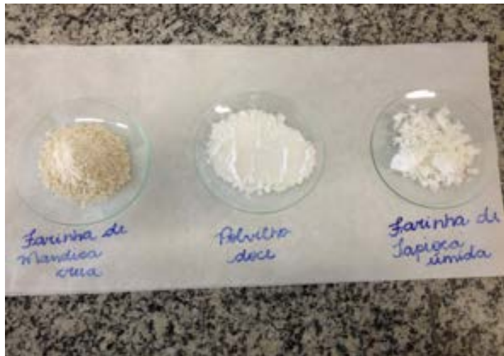
Figure 2. (from left to right) Raw cassava flour; sweet cassava starch and wet cassava flour.