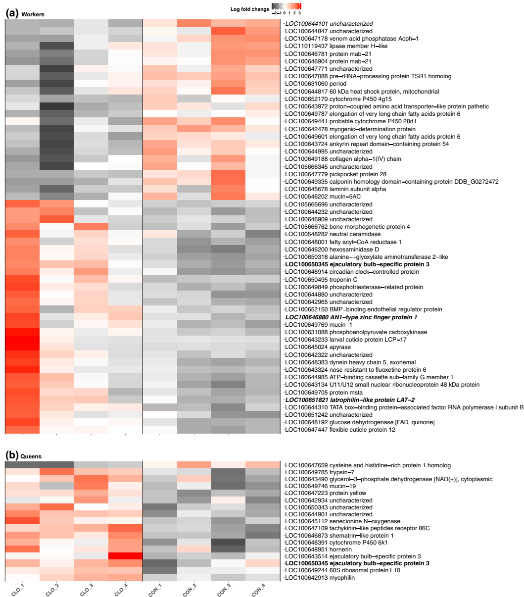
FIGURE 1 Chronic clothianidin exposure leads to gene expression changes in bumblebee workers and queens. Heatmaps displaying genes differentially expressed in workers (a; n = 55 ) and in queens (b; n = 17 ) between clothianidin-exposed and control colonies. For each differentially expressed gene, we show the log fold change for each biological replicate, as well as the gene identifier and NCBI's functional gene description. The single gene differentially expressed in both castes is indicated in bold. The single gene also differentially expressed in imidacloprid-exposed workers is indicated in italics. The two genes identified to be differentially expressed and alternatively spliced within clothianidin-exposed workers are indicated in bold and italics

identified >80% of these statistically significant genes with DESeq2 when using gene-level counts generated by the HISAT2-HTSeq pipeline as input. Similar to the kallisto-based analysis, the HISAT2-based approach identified caste- and pesticide-specific changes in bumblebee gene expression. Using this approach, we identified greater amplitude changes in gene expression in workers in comparison with queens. In addition, for both castes, clothianidin exposure resulted in greater gene expression changes than imidacloprid. Additional information on the specific findings of this comparative analysis is provided in the Supplemental Information.