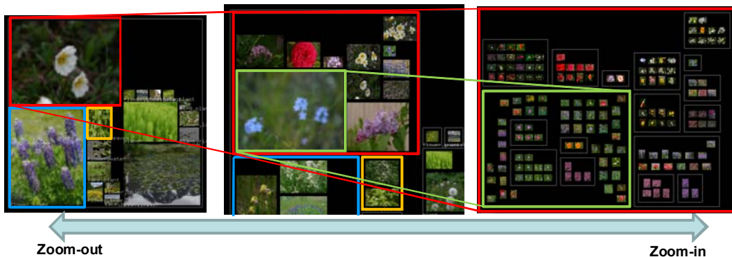
Figure 1: Overview of CAT. (Left) While a user zooms out, CAT displays representative images of higher-level clusters. (Center) While a user zooms in, CAT displays representative images of lower-level clusters. (Right) While a user further zooms in, CAT displays independent thumbnail images.

time, because CAT only loads high-level representative images first, and then only loads images in zoomed area, and free defocused images.