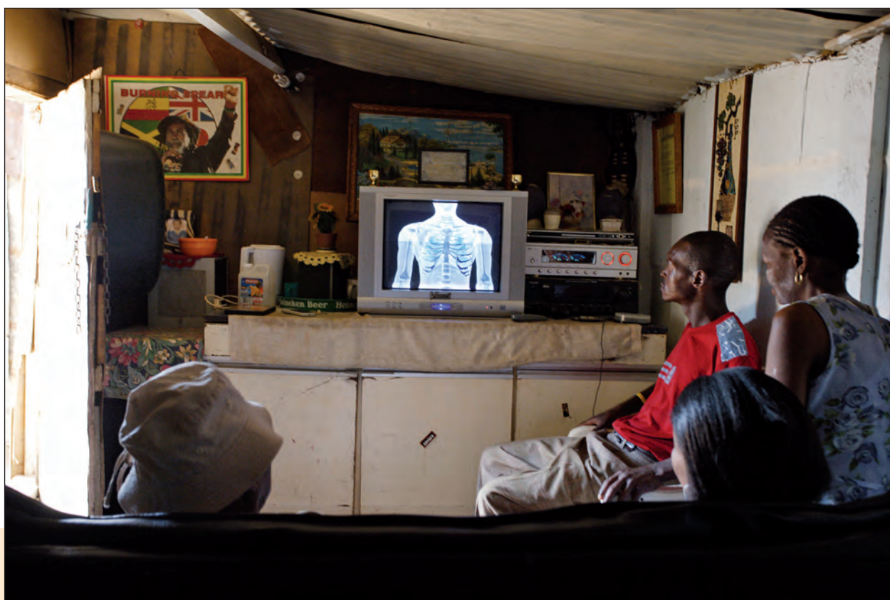
The South African Red Cross shows a Siyayinqoba educational video about TB and HIV to a family in Khatlehong. There are eight people living in the home. Their father died of TB last year after being infected for the third time. The daughter currently has MDR-TB and is on antiretrovirals. She was bedridden but is starting to feel better and able to walk around the house. Her brother is also showing symptoms of TB, and during this visit the Red Cross managed to convince him to be tested.