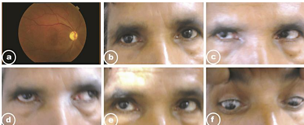
Fig. 4. After three months, fundus photograph of right eye shows pale optic disc (a) and improvement of eye movement and ptotic upper eyelid (b–f).