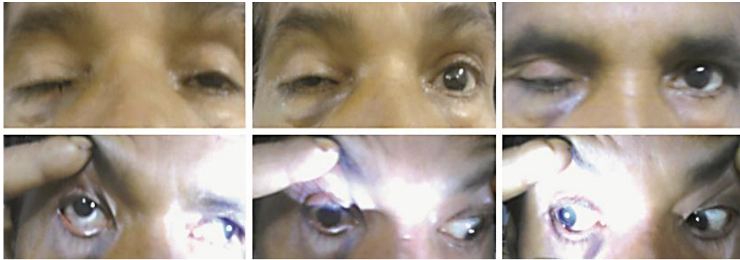
Fig. 1. Patient shows ptosis of right upper eyelid with restriction of adduction, elevation and depression.