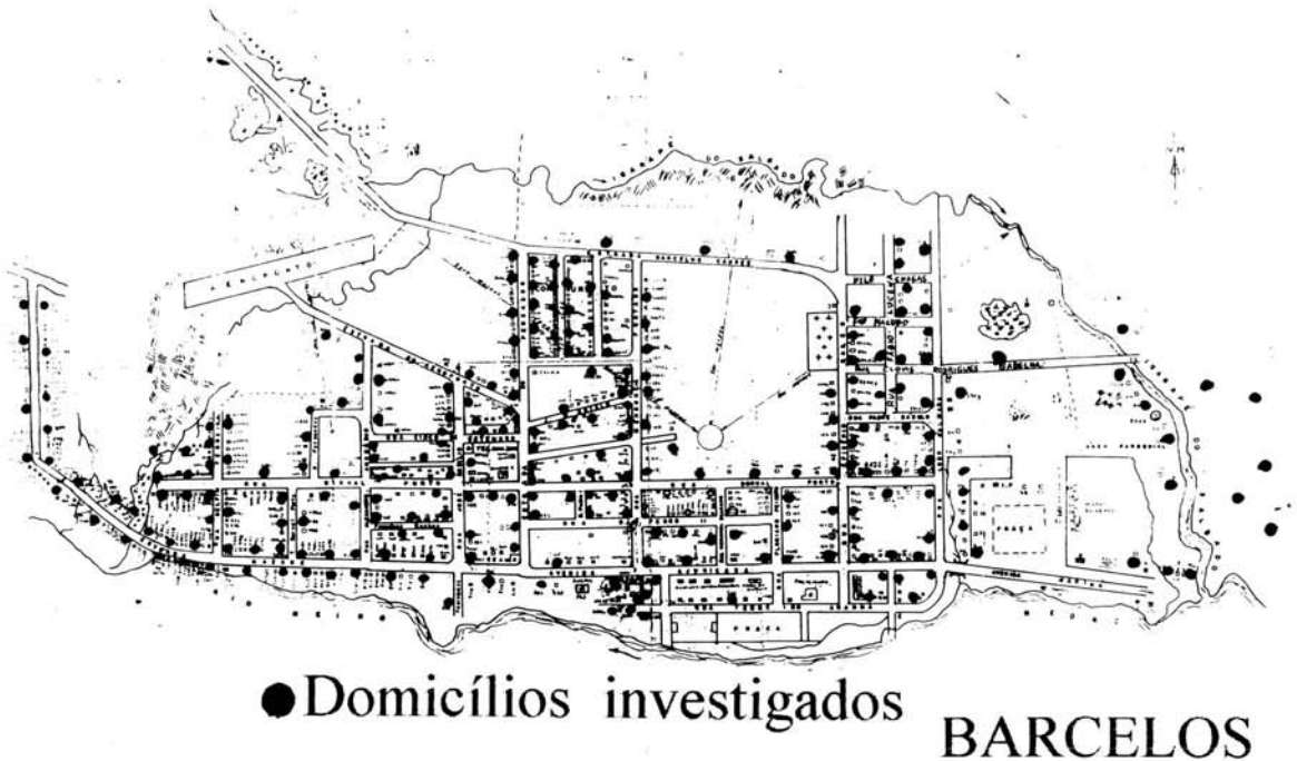
Fig. 2 - Distribution of the dwellings investigated in Barcelos

The 121,760 km 2 county of Barcelos the largest administrative district in the State of Amazonas, is located in the micro region of Rio Negro in the northern part of the State, bordered on the east by State of Roraima, on the southeast and south by the administrative districts of Novo Airão and Marãa, on the west by the administrative district of Santa Izabel do Rio Negro and on the north by Venezuela (with a latitude of 0°58'1" south of the equator and longitude of 62°56' west of Greenwich). The town of Barcelos, where this study was carried out, is located on the right bank of the Rio Negro, 490 km by river from Manaus, the capital of the State of Amazonas (Fig. 1).