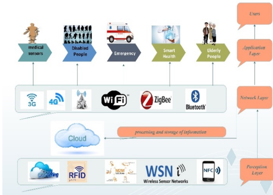
Figure 1. IoT reference architecture in healthcare

The IoT should be able to interconnect billions or trillions of heterogeneous objects across the Internet, so there is a critical need for a flexible architecture layers. The growing number of available architectures has not converged to a reference model. In the variety of models on offer, the base model is a 3-layer architecture consisting in the application, network, and Perception layers. The 3-layer structure is composed of Perception layer, the network layer and the application layer, as shown in Figure 1.[17].