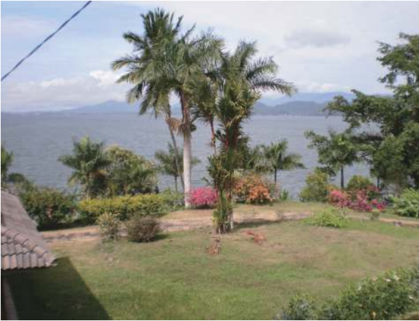
Fig. 2. Exotic species ( Bougainvillea , palm, etc.) as ornamental plants in a tourist lodge.

Roystonea regia , Duranta erecta , and Pachystachys lutea (Fig. 2).