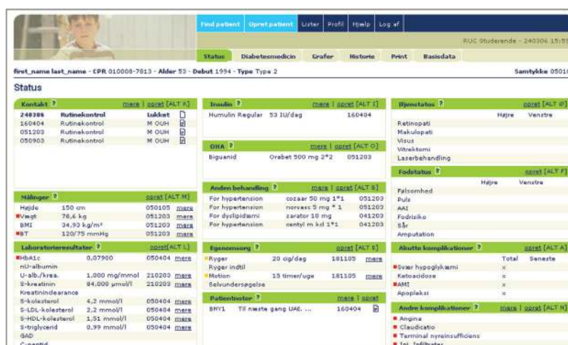
Figure 2. Screen dump System -2.

outpatient clinics are still in the process of implementing system-1 but the majority of outpatient clinics now routinely use the system. System-1 is, however, still not in use by any of the general practitioners. From October 2006 until March 2007, system-1 has been tested but only 3 out of 10 general practitioners have managed to use the system during the test period due to technical problems. So there is yet no real valid result from the use of system-1 on the part of the general practitioners.