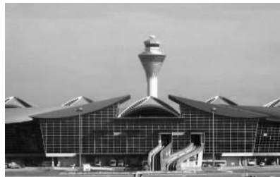
Kuala Lumpur International Airport (KLIA) Project, Malaysia