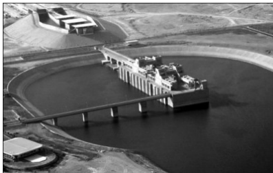
Toshka Project, Egypt