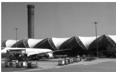
Second Bangkok International Airport, Thailand