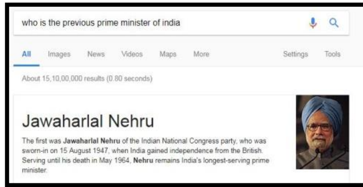
Figure 1: Misleading information provided by a popular search engine.

internet search engines mostly answer queries by matching the keywords but a librarian tries to understand the right semantics of a query and only then he refers the right data and information. Further, a Librarian can also provide referral service, if required. Though, promises of semantic web are high, there is a long way to go. A classic proof of the dumbness of the internet has been provided in Figure 1 [3].