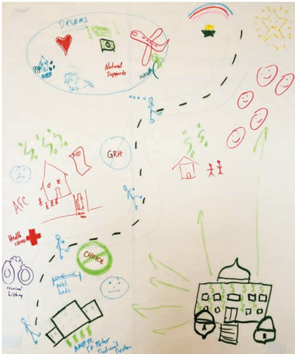
Figure 2. The map is a roadway or pathway to the life you want, beginning at the bottom where the person experiences some level of institution. When they get into Corporate Foster Care, they might encounter some barriers. The bottom right corner symbolizes government as the organization responsible for funding and rules - there's more money at the start of the journey, and lesser or none at the end. As we move up, the person is more independent. The end goal is less defined but would elicit joy.