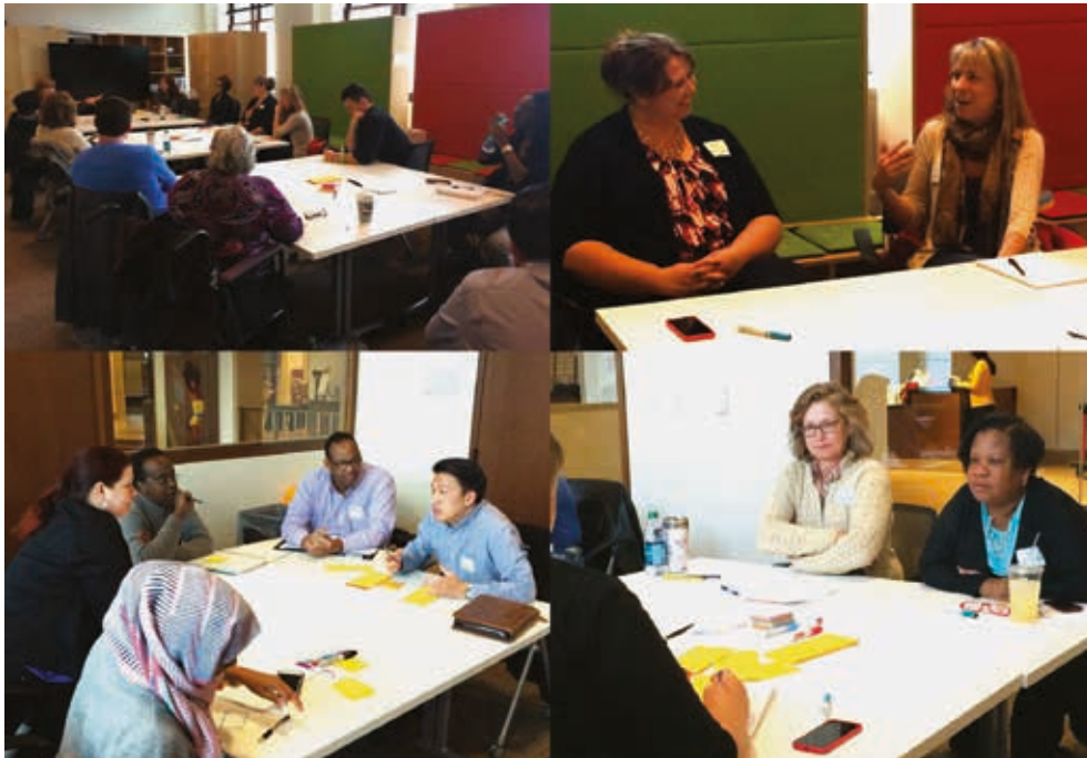
Figure 1. The process of social-impact design, involving a diversity of people utilizing design methods to elicit their ideas and possible solutions, at the design workshop. Attendees commented that they loved the collaboration and discussion across organizations in an intimate setting and were hopeful that their perspective would be heard in this process to make this system better.

first. But as the process continued in a series of participatory workshops, with diverse groups of people engaged in thinking about better ways to do this, the ideas that emerged were extraordinary, and challenging to many of the assumptions we have about government services and subsidized housing. A few things became immediately clear. By involving the people most affected by a system, we quickly learned how a system designed to be highly efficient and totally integrated could also become too oppressive and controlled. Residents depicted the adult foster care system as a limited-access highway: once you are on it, there is no way out. Such experiences show the flaw in overly designed systems, with little or no flexibility or choice, created no doubt with the best interests of people in mind, but ultimately oppressing the very ones it seeks to serve.