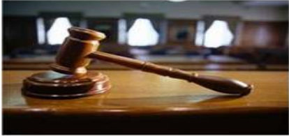
Figure 1. The Symbols Manipulation: Judicial Versus Abstract Symbols