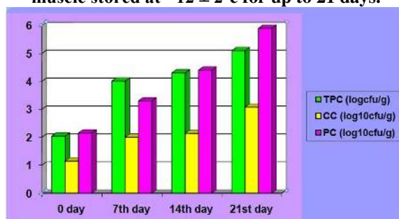
Figure 3. Changes in Total Plate Count (TPC), Coliform count (CC) & Psychrophillic count (PC) of fish muscle stored at -12 \pm 2^{\circ}\text{C} for up to 21 days.

The Psychrophillic count was also found to be increase from 2.15 \pm 0.2 log cfu/g on day 0 to 5.96 \pm 0.05 log cfu/g on final day of storage as shown in (Table 3), thus crossing the permissible limit i.e. 4.6 log cfu/g on 14 th day as proposed by Cremer & Chepley (1977). During ice storage of Croaker ( Pseudolithus senegalensis ), Ola & Oladipo (2004) found that psychrophiles increased in number and accounted for over 90% of the spoilage flora when fish were considered spoiled. The spoilage during iced storage is caused by psychrophiles irrespective of the original bacterial flora according to their findings. Liu (2010) investigated that Psychrophillic bacteria grew exponentially from initial load of 3 - 4 log cfu/g, reaching 7.4 log cfu/g on day 13 and up to about 9.0 log cfu/g in tilapia fillets at the end of storage.