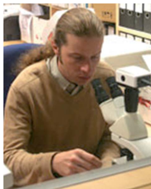
Simon J Coles

† Electronic supplementary information (ESI) available: Datasets and experimental protocols are provided for data collected on the Diamond I19 beamline, the VHF and UHF rotating anode diffractometers and a sealed tube source (image plate) diffractometer are provided. These a) serve as exemplars for data collected at the NCS and b) form the basis for a comparison of the power and capability of the different instruments. CCDC reference numbers 855293–855295. For ESI and crystallographic data in CIF or other electronic format see DOI: 10.1039/c2sc00955b