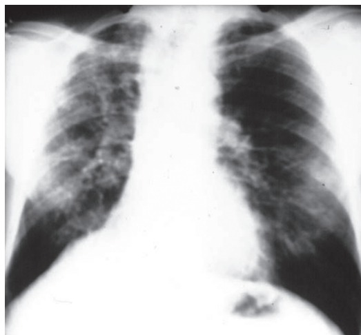
Figure 1 - Anteroposterior chest X-ray: bilateral and asymmetric reticulonodular infiltrate, predominantly in the two upper thirds.

In addition to aiding in the diagnosis, serologic tests can evaluate treatment response and disease recurrence. In these cases, elevated antibody titers usually precede clinical recurrence. Agar gel double immunodiffusion is the test that is most readily available in clinical practice, and its sensitivity and specificity are greater than 80% and 90%, respectively. Agar gel double immunodiffusion should always be titrated so that the interpretation of the therapeutic response is more accurate. (7)