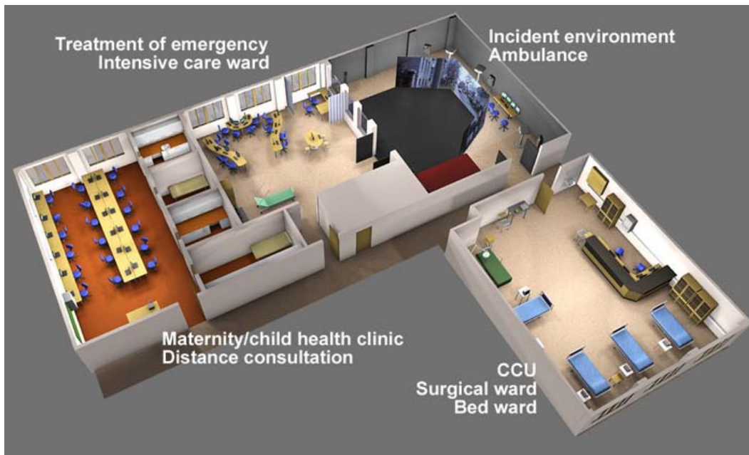
Figure 1: ENVI Virtual Center for Wellness Campus™ includes nine operational environments.

Multi-professional care teams can practice seamless cooperation during the entire healthcare process, from the scene of an accident to a virtual hospital and finally to the rehabilitation process (ENVI, 2010). ENVI is a mixed reality learning environment, as it combines physical environments and simulation manikins with immersive full-scale 3D simulation projections. In the incident environment, users can view, navigate, and interact with handheld interaction devices, so it offers full-body movement in front of a large-scale projection display.