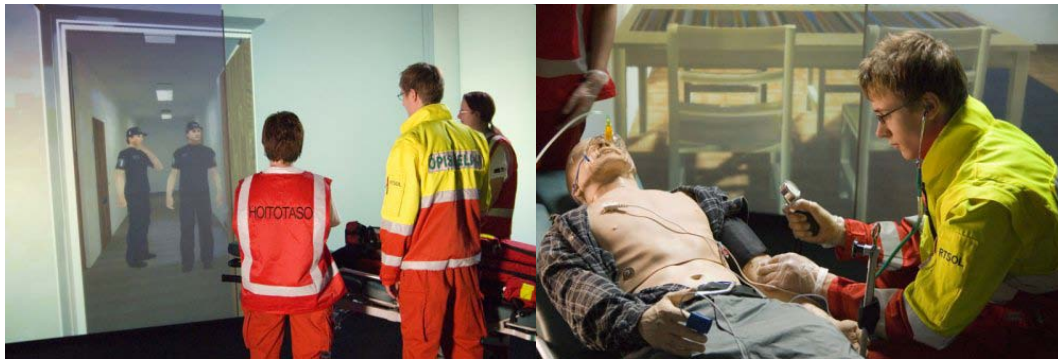
Figure 2 (left): The incident environment with 3D projection displays offers realistic and safe learning experiences at ENVI Virtual Center for Wellness Campus. Figure 3 (right): Training with a simulation manikin at the incident environment in front of the 3D projection displays.