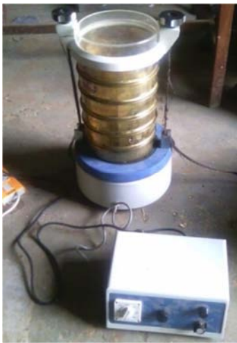
Figure 1. Fritsch shaker machine with sieve stack mounted and amplitude box.

The selection of the sieves depends on the sample quantity (as mentioned above) and the particle size distribution. The mesh sizes of the sieve stack covered the complete size range of the samples. The distribution function F(d) (mass fraction) and density function f(d) (number of particles captured between two screens) of the sample of waste sawdust were obtained from the three different wood cutting devices.