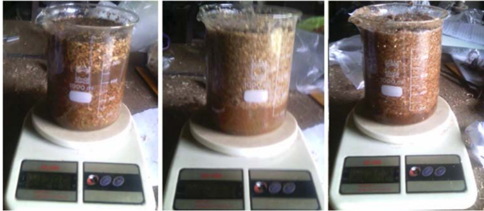
Figure 5. Test samples mixed in glass beakers.