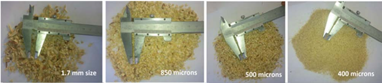
Figure 4. Measure of sample sizes retained on each sieve.

Sieve shaker (Fritsch®) was equally used to determine the geometric mean particle sizes. The geometric mean diameter of feedstock was determined using ASAE Standard S319.4 test procedure [16].