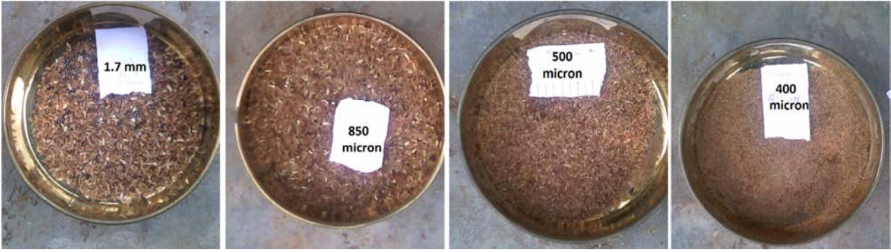
Figure 3. Sample material retained on each sieve.

Cumulative percent of material retained in the n^{th} sieve