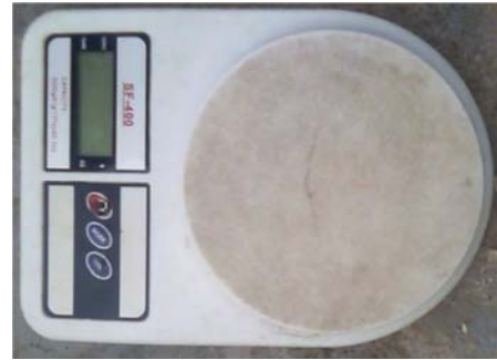
Figure 2. Analytical electronic weighing balance.

For precision in weighing of mass fractions of sawn material, an analytical electronic laboratory weighing balance SF-400 capacity 5000gX1g/177ozX0.1oz, with readability to 0.01 g was used (Figure 2)