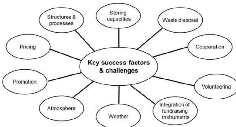
Fig. 3 Operating CFMs – key success factors and challenges

The availability of a sufficient number of volunteers is essential both beforehand, on and after market days. Moreover, CFMs seem to be successful when they adequately link the aforementioned types of volunteering as they rely on different forms and intensities of volunteering. While volunteers who engage themselves only episodically to do project-related work can accomplish certain tasks, other tasks (such as the overall management and coordination of activities or gathering goods) require a regular, long-term, and time-consuming commitment. Such duties also require certain availability in times of common working hours. Thus, mobilizing the generation 60+ is vital. The NPOs analyzed count on many long-term volunteers supporting their CFMs for many years. Nevertheless, various volunteers already reached old age (between 70 and 80), are partly overcharged by physical labor, and often wonder whether they will find successors when they (have to) cut back their commitment. Besides, half of the interviewees take the view that volunteers need specific talents or skills like sales talent, management skills or experience in public relations.