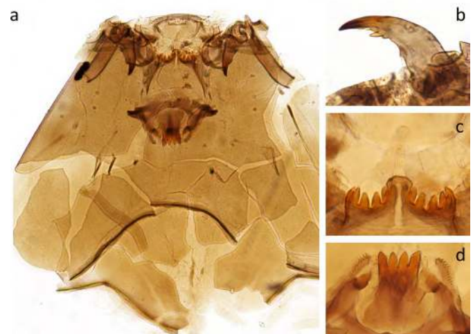
Figure 2. The head capsule (a), mandible (b), mentum (c) and ligula (d) of Derotanypus larva.

One chironomid species ( Derotanypus cf. sibiricus ; Figure 2) and aquatic bug Arctocoris carinata represent new records for Slovakia. The only European species of Derotanypus is D. sibiricus (Saether and Spies 2013), so the larvae found in a small, permanent pond in Račkova dolina valley (1,717 m a.s.l.