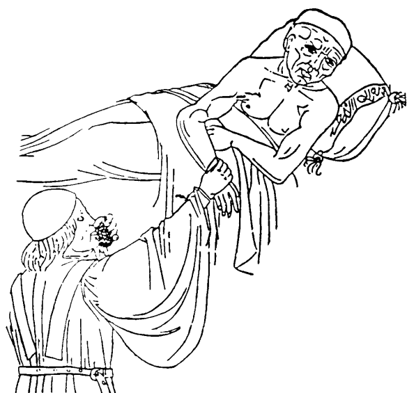
Table 1. Body odor is a diagnostic indicator for many diseases a

Physicians have long used odor to diagnose various diseases (Table 1), as illustrated in this woodcut. Nearly two centuries ago, one of the originators of Hindu medicine, Susruta Smhita, claimed that 'by the sense of smell we can recognize the peculiar perspiration of many diseases, which has an important bearing on their identification' 43 . One thousand years ago, the Arabian physician Avicenna observed that an individual's urine odor changed during sickness. Physicians once tasted a patient's urine to diagnose disease. For example, diabetes mellitus (which means 'passing through sweet') was once diagnosed by a patient's sweet urine and for centuries the disease was called 'pissing evil'. Veterinarians often use halitosis and other odor cues to diagnose diseases, such as bovine ketosis. Technological devices are currently being developed to diagnose disease from breath and other odor samples. Fisher long ago pointed out that bad breath may be sexually unattractive because halitosis is associated with various diseases 47 . Hamilton and Zuk suggested that when females are inspecting potential mates they should, like physicians, 'unclothe the subject, weigh, listen, observe vital capacity, and take blood, urine and fecal samples' 5 . Thus, it is surprising that chemical signals have not received more attention as potential disease indicators by students of sexual selection.