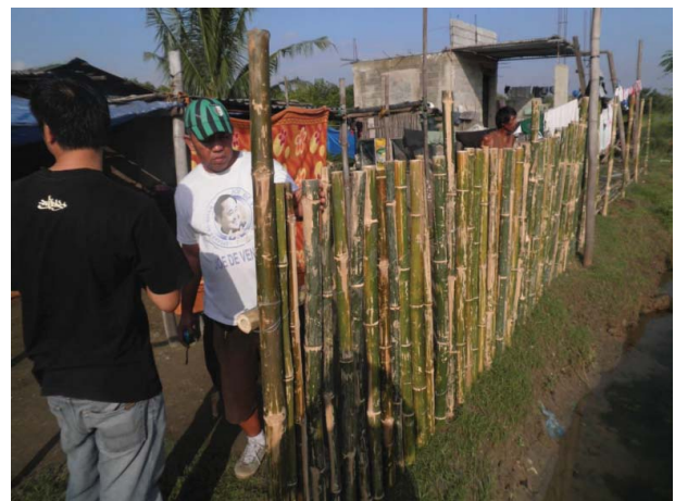
Figure 6. Porch barrier.

A pilot study in rural Bangladesh (2004–2006) exploring child supervision practices for drowning prevention using a door barrier and a playpen found that of the 2694 observations: children were directly supervised or protected by a preventive tool in 96% of visits; households with a supervision tool had a significantly lower proportion of