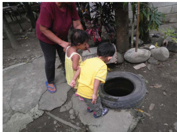
Figure 2. Open dug well (community well).

A portable four-sided enclosure in which a baby or young child can be safely placed without constant supervision. Families living near bodies of water with children less than 1 year of age were identified and became the