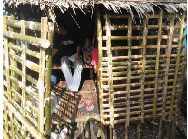
Figure 5. House/door barrier.

the drowning prevention committee identified priority families to receive this initiative, families of children who had died from drowning and families with children who experienced near-drowning event, and families that needed the barriers, such as those with many children or children who were at risk (living near water hazards) were provided with barriers. These families were supported in constructing house barriers and backyard fences (porch barriers) so that the children are not able to access bodies of water. At the time of writing this article, 40 house barriers and backyard fences had been built. Further work is required to explore the communities' acceptance of the barriers, costs and ongoing use.