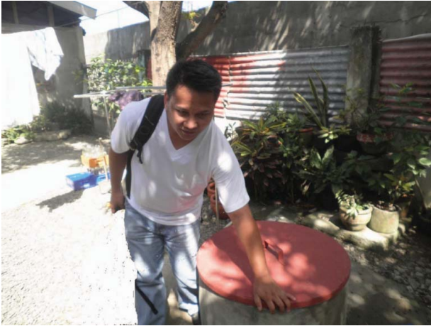
Figure 3. Reconstructed and covered community well.

beneficiaries of the playpens (Figure 4) which were developed in the community. According to the mothers, there were times when they leave their young children in their homes so that they can do their household chores and or engage in work. They were worried that their children may fall into bodies of water surrounding their houses. They believe that the use of playpens, where they can leave their children temporarily, will be safer for their children. At the time of writing this article, 10 playpens had been implemented.