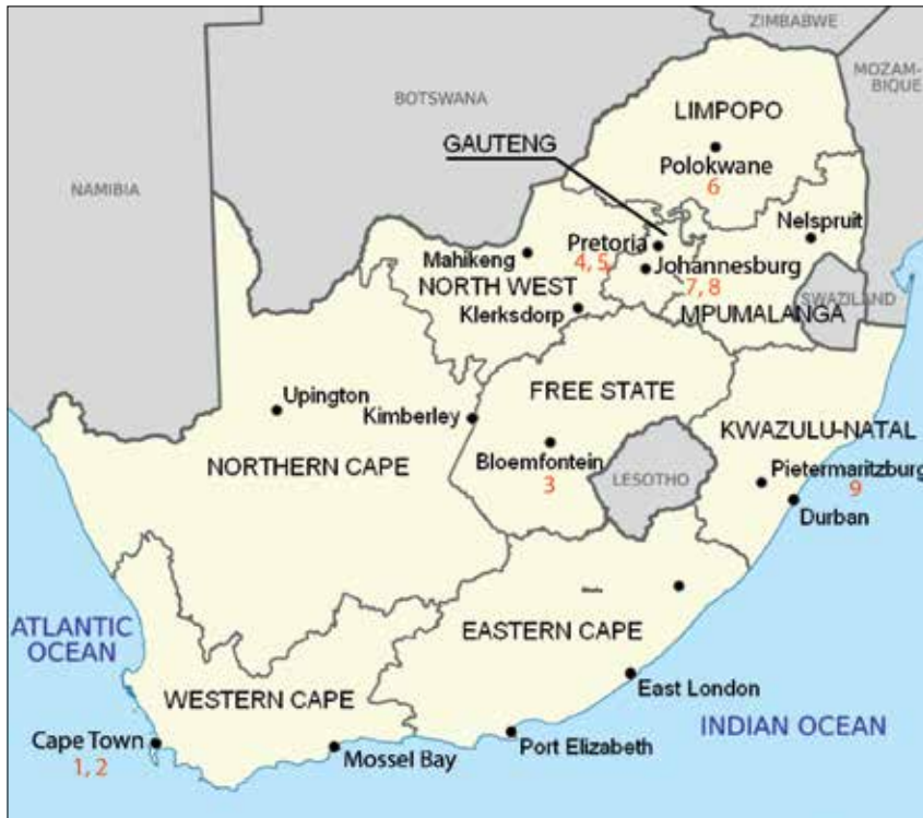
Fig. 1. Map of SA showing the nine provinces and the location of the nine POUs. (Adapted from Hton/CC-BY-SA-3.0 of 25 January 2010, available from http://commons.wikimedia.org/wiki/File:Map_of_South_Africa_with_English_labels.svg . 1 = Tygerberg Hospital (referral for the Western Cape); 2 = Red Cross War Memorial Children's Hospital (referral for the Western Cape and Eastern Cape); 3 = Universitas/Pelonomi Academic Hospital Complex (referral for the Free State, Northern Cape and parts of the Eastern Cape and North West); 4 = Kalafong Hospital (referral for Northern Gauteng and Mpumalanga); 5 = H F Verwoerd Hospital (referral for Northern Gauteng and Mpumalanga); 6 = Ga-Rankuwa/George Mukhari hospitals (referral for Limpopo); 7 = Chris Hani Baragwanath Hospital (referral for southern Gauteng and North West); 8 = Charlotte Maxeke Hospital (referral for southern Gauteng and North West); 9 = King Edward/Inkosi Albert Luthuli Central Hospital (referral for KwaZulu-Natal and parts of the Eastern Cape.)

Collection of data on childhood cancers throughout the country was started in 1987 by the South African Children's Cancer Study Group (SACCSG) as a collaboration between the nine referral POUs shown in Fig. 1.