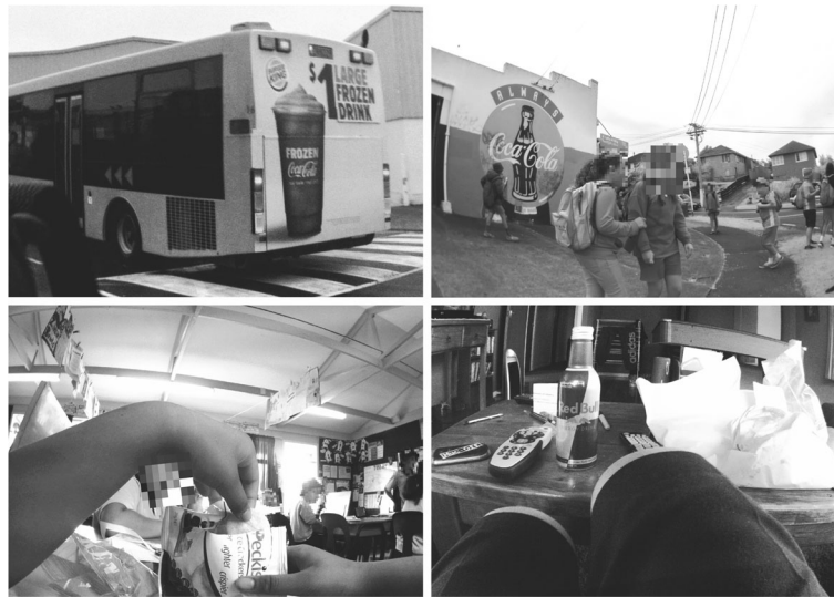
Fig. 3 Sign for sugary drink in public space, sign for sugary drink in public place, product packaging for snack food at school, product packaging for sugary drink at home