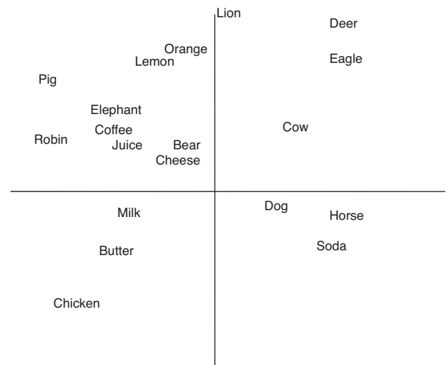
Figure 1. A spatial depiction of a typical 9-year-old's representation of a set of animals and foods. The proximity between words represents how closely related the child believes these objects are.

Thus, depending on how they represented the materials, children were differentially suggestible and their metamemory