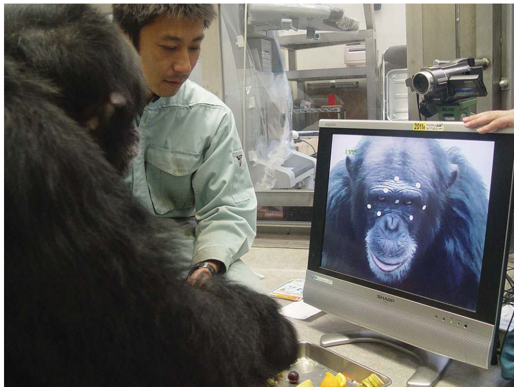
Figure 1. Experimental set-up. A male chimpanzee faces a monitor. Stickers are placed on his face and head.

In step 2, one of the following eight videos (conditions 1–8) was presented for 2 min: a live video (condition 1), a 1 s delayed video (condition 2), a 2 s delayed video (condition 3), a 4 s delayed video (condition 4), a video of the subject that was filmed more than one week prior in which stickers had been placed on the face and head of the subject (condition 5), a video of the subject that was filmed more than one week prior, in which no stickers were present on the face and head (condition 6), a video of a human who had stickers placed on the face and head (condition 7) or a video of a human with no stickers (condition 8). In steps 1 and 2, an experimenter gave a small piece of food about every 20 s to ensure that the chimpanzee remained in a relaxed state to enable recording of their behaviour, regardless of the chimpanzee's behaviour during the test.