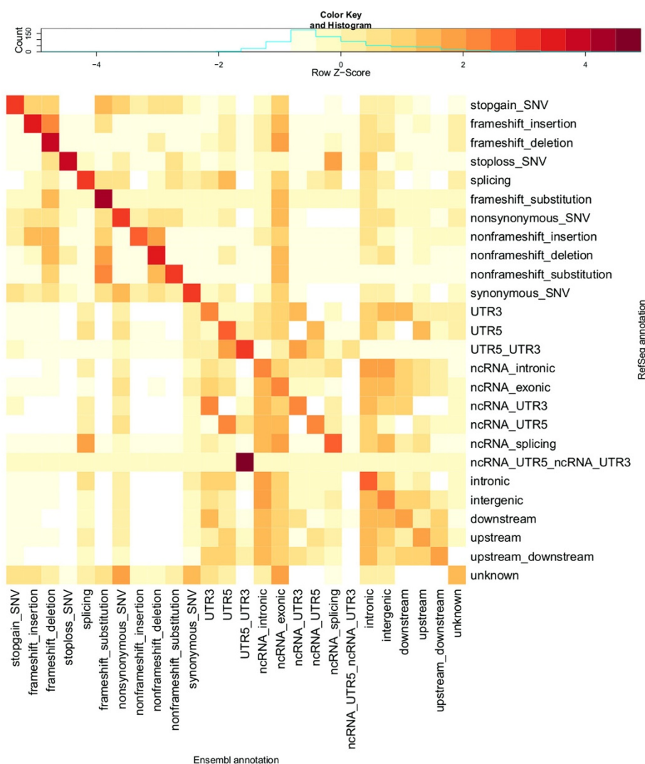
Figure 2 REFSEQ-normalised heatmap of annotation comparison. This heatmap shows scaled numbers of variants ( \log_{10} transformation with offset of 1 applied) for all different combinations of ANNOVAR categories of annotations when using the ENSEMBL transcript set (columns) and REFSEQ transcript set (rows). Values are Z-scaled (mean-centred, divided by standard deviation) by row (each row is scaled separately; contrast with Figure 3). The key above the heatmap shows the values indicated by different colours. This row-normalised heatmap allows us to see which categories of annotation are over-represented (relative to the total number of variants in the column/category) in the ENSEMBL annotations for each category (i.e. row) of REFSEQ annotation. Ideally, all of the dark red squares would lie on the diagonal, with white squares on the off-diagonals, indicating complete agreement in the annotations from the two transcript sets. Compare with Additional file 1: Table S1, which provides the numbers used for this heatmap. Categories are ordered as per Table 1.

tools and 556,387 (87.2%) have category matching annotations. However, the match rate is substantially lower (65% for exact matches, 66% for category matches) for LoF annotations (Table 2). We observe that 89% of exonic variants from VEP get an exactly matching annotation from ANNOVAR and 96% of exonic variants according to ANNOVAR get an exactly matching annotation from VEP. These percentages of agreement should not be taken to show that ANNOVAR is ‘more accurate’ than VEP – the difference between the tools for exonic variants is driven by the larger number of splicing annotations from VEP,