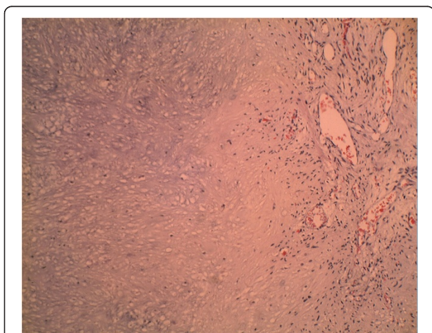
Figure 2 Malignant tumoral proliferation poorly differentiated with chondroid foci (hematoxylin and eosin \times 200 ).

Sarcomas as a primary cancer of the thyroid gland are extremely rare, and have been mainly reported as individual case reports [4]. Metastases in the thyroid gland represent less than 1% of thyroid gland cancers [15,16]. The most frequent primary sites are kidney carcinoma (23%), breast carcinoma (16%), lung carcinoma (15%),