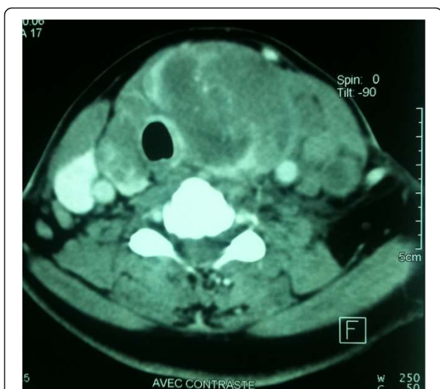
Figure 1 Computed tomography scan showing the thyroid tumor.