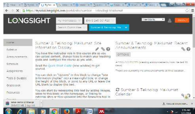
Figure 2. Example Sakai Site