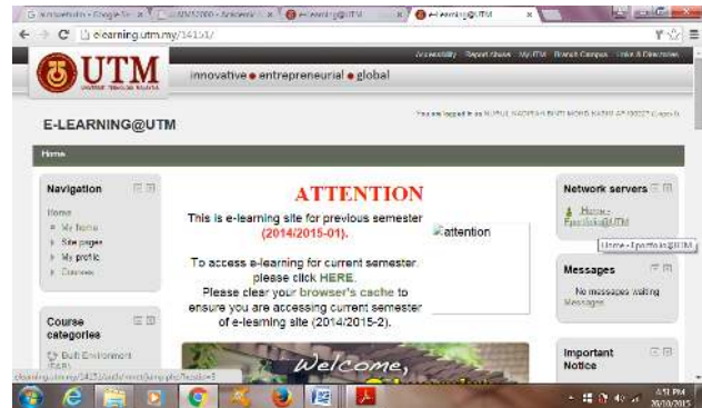
Figure 1. Example Moodle site

The ATutor platform is an LMS that is based on open source web technology used to develop and present online courses [29]. The leader can copy, distribute and edit the ATutor under the public licensing conditions of a GNU General Public License (GPL). The key characteristic of ATutor is its accessibility, as it ensures that users are able to participate in activities as students, instructors and administrators. In addition, the use of IMS/ISO for support allows students to adapt the environment and the content to the needs of their courses. Instructors and students are able to manage their ATutor courses, and users can send and receive personal messages from other users. Each user has their own file storing utility, and this storage can be shared with other users. Thus, all the content and the course structure can be stored and backed up in ATutor.