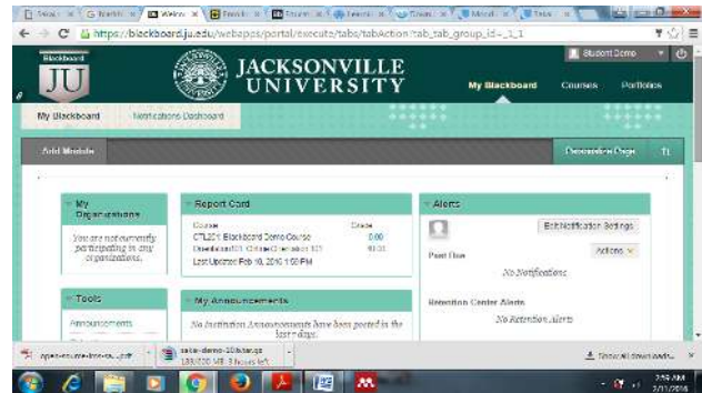
Figure 4. Example Blackboard site

Common features shared by all platforms are flexibility, ease of use, accessibility and user friendliness, while the feature that is lacking in all of the platforms is the ability to integrate with other systems, and only Moodle and Sakai have a personal area for writing drafts and journaling, and managing personal and private information. Meanwhile, only ATutor allows lecturers and students to coordinate and manage courses, as well as giving each user their own file storage utility that can be shared with other users, and allowing the content and structure of courses to be saved and backed up in the software. Giving the administrator the power to limit access to specific users or roles to a few users is only available on SuccessFactors. SumTotal provides contextual learning, assessments of talent, and tools to increase the efficiency and effectiveness of workforce management. These features are less visible in the platform because each platform has its own advantages and objectives in developing the software for the use of certain parties.