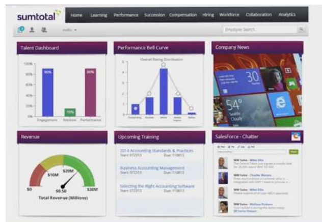
Figure 6. Example SumTotal site

The main difference between open source and commercial platforms is in terms of licensing fees: commercial LMS require licensing fees per user, usually on an annual basis, with a subscription and maintenance fee on top to make sure the LMS is kept up to date. Open source LMS platforms do not require a licensing fee, as they are developed under a GNU General Public License (GPL), and users only need to download the code. Open source platforms therefore provide freedom, in that modifications can be made to the source code according to users' needs, and the institution has the ability to change the provider in future if they want a better service. However, a commercial platform cannot be modified according to users' needs because commercial LMS are typically designed in accordance with a set of standards. This difference is significant and will influence the selection of a specific platform because in LMS selection, it is important for an organisation to consider how it plans to deliver training materials to the students, and the features of the LMS must meet the requirements of the organisation.