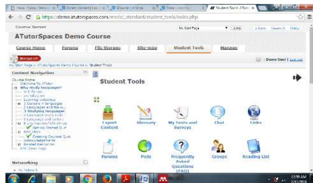
Figure 3. Example ATutor site