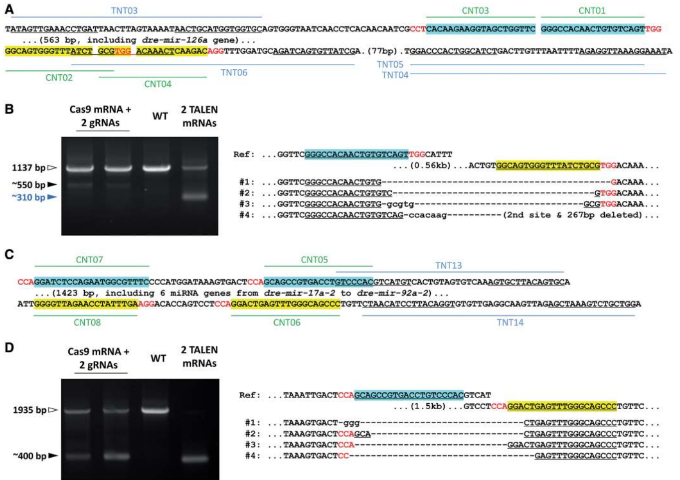
Figure 3. Chromosomal deletions in zebrafish in the region of an miRNA gene and an miRNA gene cluster mediated by Cas9 and gRNA pairs. (A) Sequences of the TALEN and Cas9/gRNA target sites around the miRNA gene dre-mir-126a . The protospacer target sequences of the Cas9/gRNA are highlighted with different colors; the 3-nt sequence of PAM (-NGG, or shown as its reversed sequence CCN-) is shown in red. The binding sites of TALEN monomers are underlined. (B) Chromosomal deletions induced by Cas9 and two gRNAs targeting this locus. The result from one of the four combinations of gRNA pairs used to generate deletions in this region is shown here, and the results for other gRNA combinations can be found in Supplementary Figure S2E. Deletion induced by two pairs of TALENs is shown in the last lane for comparison (as a positive control). The PCR products of wild-type sequences (white arrowhead), sequences with deletions induced by Cas9/gRNAs (blue arrowhead) or TALENs (black arrowhead) are indicated. (C) Sequences of the TALEN and Cas9/gRNA target sites around the miRNA gene cluster on Chr. 9 (from dre-mir-17a-2 to dre-mir-92a-2 ). The target sites of Cas9/gRNA and TALENs are indicated as shown in (A). (D) Chromosomal deletions induced by Cas9 and two gRNAs targeting this locus. The result from one of the four combinations of gRNA pairs used to generate deletions in this region is shown here, and the results for other gRNA combinations can be found in Supplementary Figure S5C. Deletions induced by two pairs of TALENs are shown in the last lane for comparison (as a positive control). The PCR products of wild-type sequences (white arrowhead) and sequences with deletions induced by Cas9/gRNAs or TALENs (black arrowhead) are indicated. A relatively longer extension time for PCR was used in this experiment to simultaneously amplify the wild-type allele.

Cas9/gRNAs were lower than those of corresponding TALENs (Figure 3B and D and Supplementary Figure S5). The deletion rates in TALEN mRNA-injected embryos were no <25% in both loci, whereas those injected with Cas9/gRNAs were ~1–3%, as roughly evaluated by PCR amplification and comparison with the serial dilutions of reference genomes from F 1 heterozygous embryos targeting the same chromosome region by TALENs (Supplementary Figure S6).