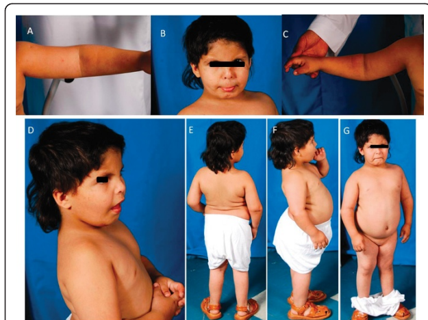
Figure 1 Patient photos. Photos showing the patient and clinical phenotypes: A) Left arm showing bent elbow, B) Face indicating long philtrum of upper lip, C) Right arm with bent elbow, D) Facial features including small ear lobe from left side, E-F) Full body indicating scoliosis, short stature, micro-retrognathia, respectively.

At 5 9/12 years of age his height, weight and head circumference were 83 cm, 13 kg and 47.5 cm. These represented the medians of 19/69, 24/69 and 14/69 respectively; and all were well below 3 rd percentile. He had micrognathia, small ears, impalpable testes, elbow deformity and kyphoscoliosis. He had a short and small penis in addition to the undescended testicles. The system examination including chest, heart, abdomen and central and peripheral nervous system were all normal. The blood count, renal and hepatic profile and other chemistries were within normal limits. The ECG was normal. A karyotyping and FISH examination for 22q11.2 region were normal. The diagnosis of panhypopituitarism was entertained. The IGF1 was 24 mEq/Lv. The TS and TSH were normal. Up to seven years of age, he showed poor speech, developmental delay and growth retardation; his height was 87 cm, at 2 years chronological age was 6 years. At present he is 10-year-old with no improvement in his clinical findings (Figure 1A-G).